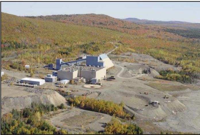
Figure 3. Aerial view of the Mount Pleasant Sn–W–Mo–Zn–In Mine, southwestern New Brunswick.

zones, 3) further characterize the nature of the deposit at depth, and 4) demonstrate evidence to support the source of the gold and the controlling factors on the mineralization.