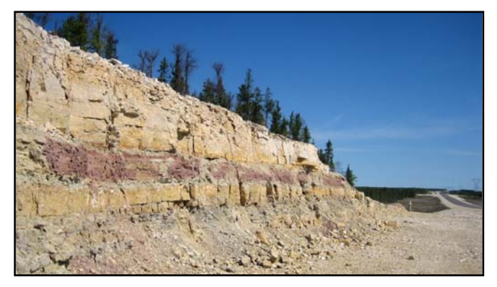
Figure 2. Upper portion of the Stonewall Formation, including the reddish t -marker bed, north of Grand Rapids, MB.

and Geochemical Perspectives; and the symposium on Life and Times of Phanerozoic Seas (in Honour of Rolf Ludvigsen).