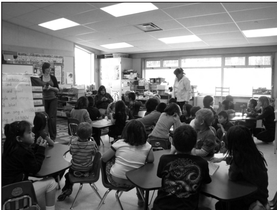
Figure 2. University of Victoria undergraduates engaging with students in classroom presentations.

Quesnel (3), Smithers (4), Cranbrook (19), Williams Lake (14), Vanderhoof (4), Fraser Lake (5), Burns Lake (5), Houston (7), Terrace (5), and Prince Rupert (5). A total of 127 presentations were delivered, in 44 schools, to 2615 students.