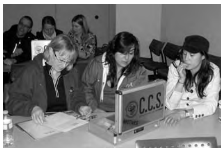
Figure 5. Teachers investigating the Cretaceous Crime Scene at the Royal Tyrrell Museum.