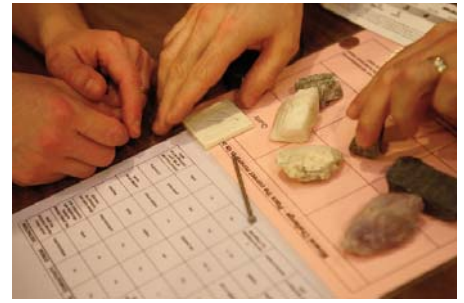
Figure 3: Toronto Secondary School teachers taking part in a workshop in which they discovered how to identify rock-forming minerals.

Mining Matters also runs workshops for teachers. The success