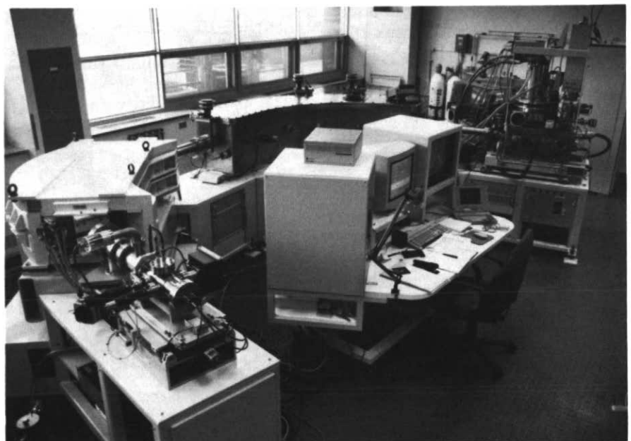
Figure 1 Overview of the Geological Survey of Canada's new SHRIMP II ion microprobe in the ground floor laboratory at 601 Booth Street, Ottawa.

Over the past 15 years, both SHRIMP I and later SHRIMP II have proven highly successful performers throughout a