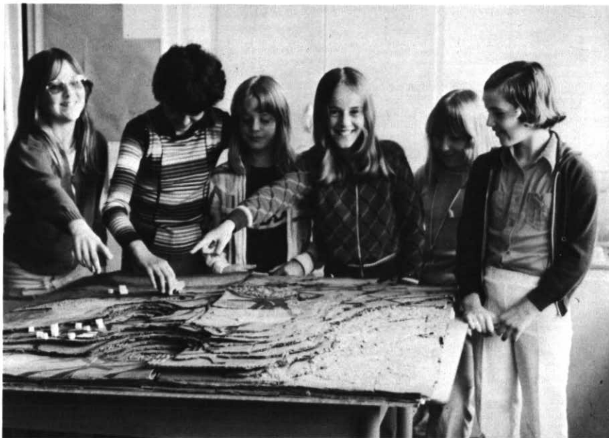
Figure 1 Grade 7 students in B.C. built a model of an open pit mining operation to familiarize themselves with the people and processes in mining. The students and teachers in B.C. and Ontario are involved in the

Completing ongoing programs in two Provinces as well as starting the Project in others, remains a question of available funds. Besides mining companies, the fundraisers are approaching the support industry, suppliers, unions, banks, accounting firms, professional services and individuals for contributions. Associated groups such as the Mining Women's Association of Greater Vancouver are assisting the project with materials and other services.