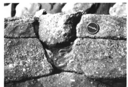
Figure 2 Side view