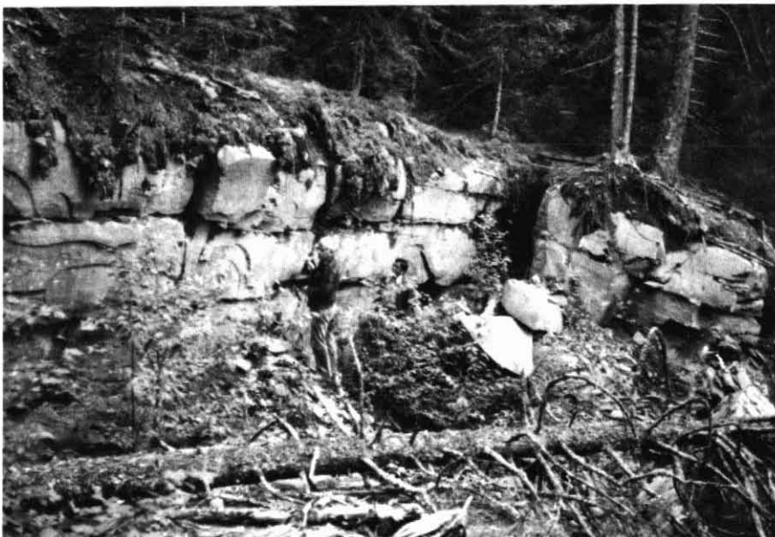
Figure 4 Effects of gravity sliding along parting surfaces (parallel to bedding) and offsets across joints, in Boss Point Formation.