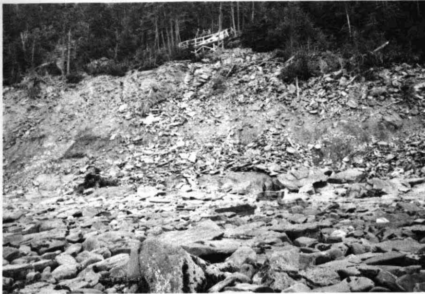
Figure 3 Gravity slide along purplish red shale member of Maringouin Formation, severely affected by marine erosion. The recently constructed wooden walk-way has in part been pulled apart as a result of sliding towards the bay.