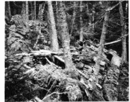
Figure 5 Effects of gravity sliding on vegetation.