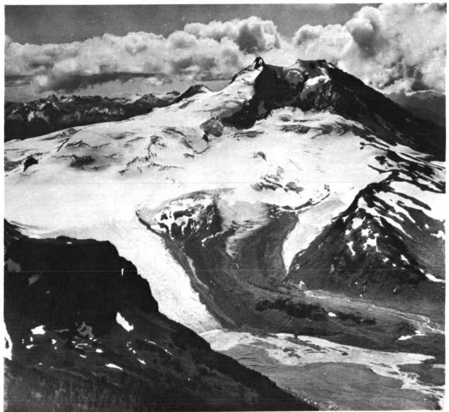
Figure 1 Mount Garibaldi, a Pelean volcano erupted during the waning stages of the last Cordilleran ice sheet.

One of the fringe benefits of a jet flight from San Francisco to Vancouver, provided one has a window seat and a clear day, is a perspective of some of the world's most beautiful volcanoes. A few minutes out of the Bay we see the ragged Sutter Buttes protruding anomalously out of California's Great Valley. Then at the north end of the Sierra Navadas is Mt. Lassen, scarred