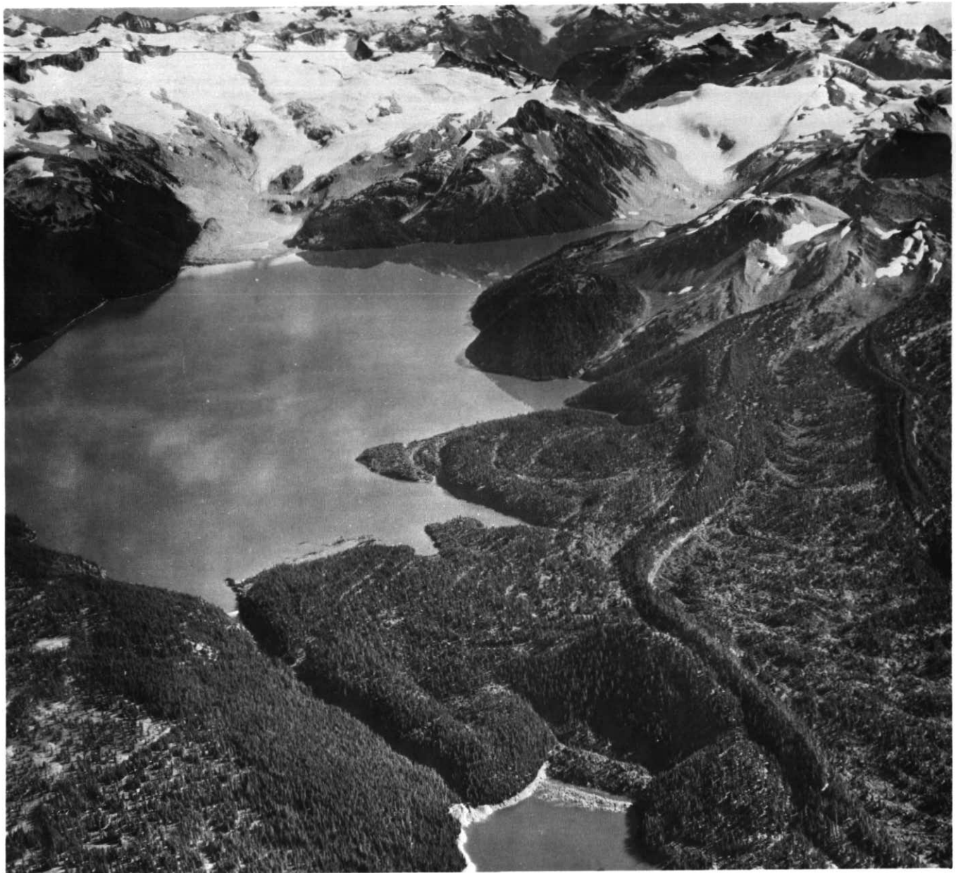
Figure 2 Postglacial Clinker Peak lava flow (right) and lava-dammed Garibaldi Lake, 40 miles north of Vancouver, B.C.

Most of the U.S. volcanoes mentioned are National Parks, or Forests, or areas set aside in some way for study, recreation, and enjoyment. Basically they provide extensive areas at the alpine meadow elevation that appeal to all nature lovers. But a great many people are turned on by the scenery of volcanic terrains. They feel the vibes of the restless, anomalous and transient topography whether or not they know any geology.