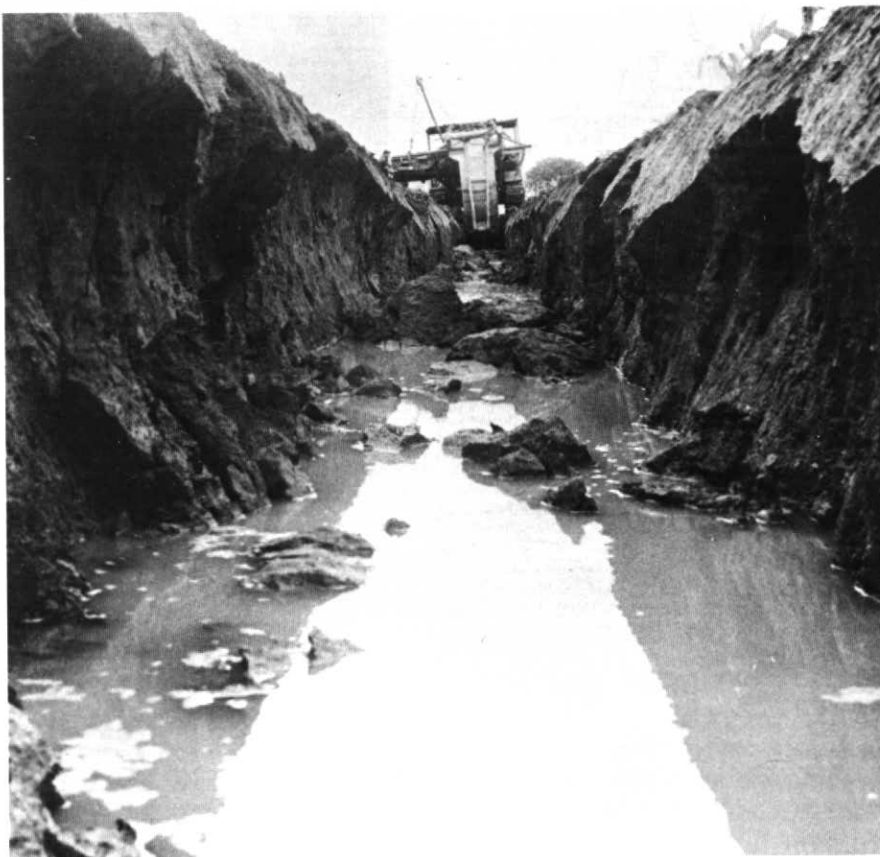
Figure 1 A pipeline excavation illustrating severe side calving.

A typical soil profile is broken into a series of horizons (A,B,C)