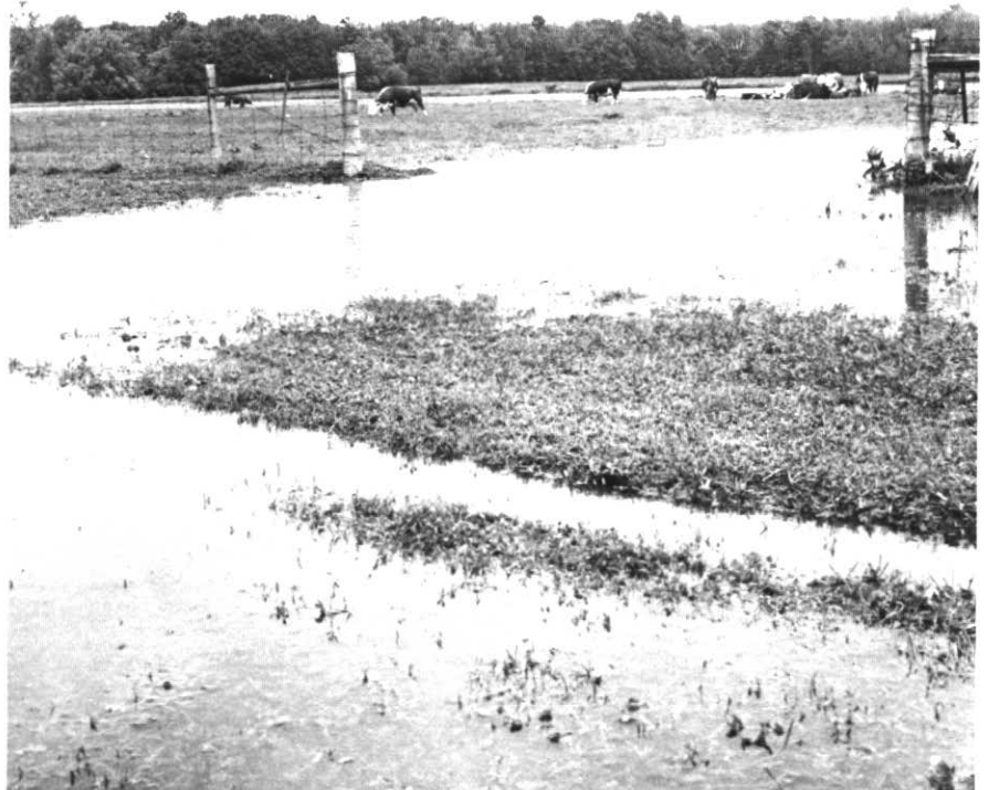
Figure 2 Post-construction ponding above a pipeline easement.

Pipeline gradient and cover requirements may be difficult for utilities to achieve over a long distance, and it may be more expedient to fill certain critical areas to obtain adequate cover rather than lowering the invert elevation. If this accidentally obstructs a drainage outlet system or causes silting that shallows a previous outlet drain, the exit of water from main drains is greatly inhibited and the entire drainage system on a farm may be jeopardized. It is extremely unlikely that adequate compensation can ever be obtained for this type of damage to the land surface topography.