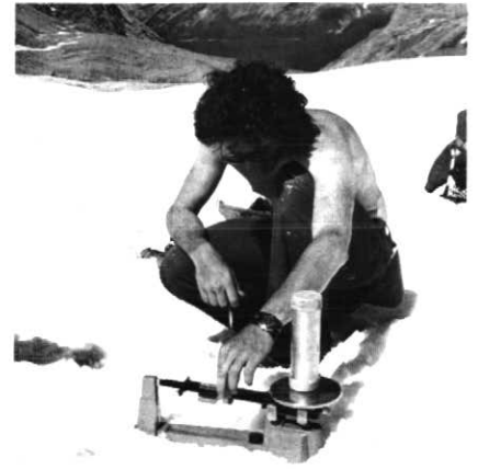
Figure 1 Snow density determination, Peyto Glacier.