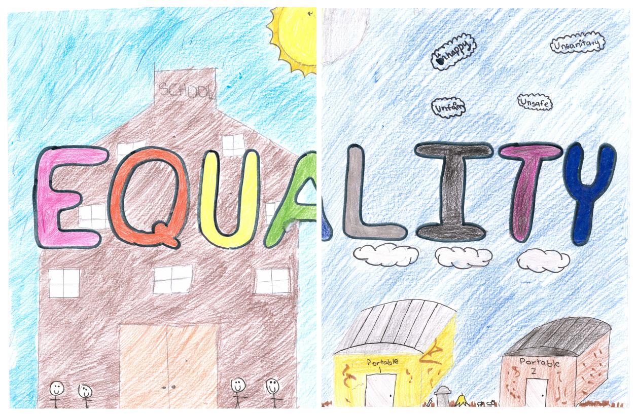
Click here to view a larger image