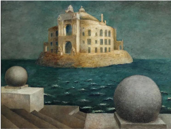
Figure 2. Oleksandr Roitburd, “Prybuttia na ostriv Kiferu” (“The Arrival to the Island of Cythera”) from the cycle Metaphysics of the Myth (2018), in the private collection of the artist’s daughter Betty Roytburd, reproduced with permission.

This, however, is a multi-layered, playfully intertextual work that references not only De Chirico and Iehorov, but also Vitalii Komar and Aleksandr Melamid, the founders of sots-art as a quintessential form of postmodernist art practice in Soviet and post-Soviet contexts: Roitburd's opera house takes the place of Komar and Melamid's Moscow kremlin in a painting from their “Nostalgic Socialist Realism” series, where it likewise is an island floating in an imaginary landscape.