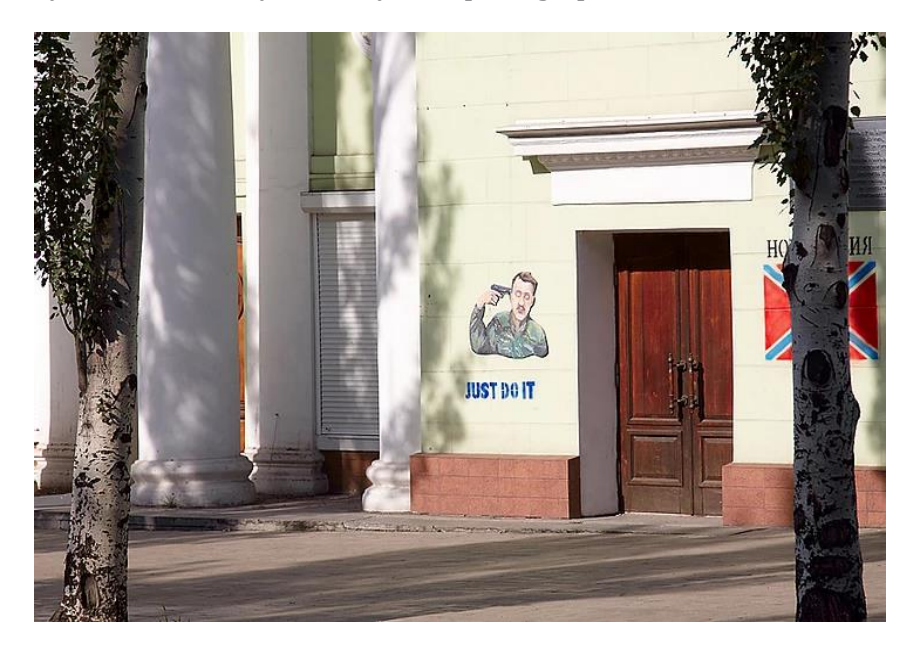
Figure 4. Serhii Zakharov, view of the image of Strelkov with inscription "Just Do It" next to the Novorossiia's flag on the building of the former Komsomolets Cinema, Donetsk, 2014<sup>35</sup>

Consider Zakharov's representation of Igor' Girkin, better known by his pseudonym Strelkov. A colonel of the Russian special operations forces, Strelkov participated in the initial phase of the invasion of the Donbas and eventually took the position of "defence minister" in the so-called "Donetsk People's Republic" (Holovn'ov). Zakharov's bust painting shows him as a clumsy figure of a dull and sad middle-aged man with a mustache, who's attempting to shoot himself in the head with a Makarov pistol. There is a "Just do it" inscription next to Strelkov, encouraging him. Borrowed from the Nike brand slogan, this phrase refers ironically to the common saying "go shoot yourself," which is used as a reaction to an action with terrible consequences. Zakharov installed the Strelkov image onto the wall of a building, next to Novorossiia flags painted by rebels, thus disguising his