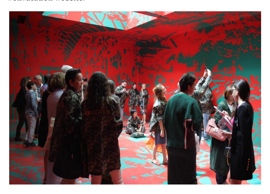
Figures 7 and 8. The #onvacation performance inside the Russian pavilion at the Venice Biennale on 6 May 2015.

Crimea.<sup>47</sup> The instructions were simple: find an official representative of the #onvacation team, request a camouflage set, occupy whatever place you want, and post a selfie on a social media account with a corresponding hashtag. As the project got traction, the Biennale security left the activist artists alone and the Russian reaction scaled down to a dismissive tolerance. The tactical occupations continued until the end of May, leaving a memorable media trace. The press was favourable to the project and raised it to the top Biennale news story. The collection of links to major press publications archived on the project's website numbers eighty-four entries, including such top publications as The New York Times, Artforum, The Washington Post , and The Guardian . In early June, after the last activist left the show, Izolyatsia issued a press release, taking responsibility for the occupation, and announced the winner of the trip to Crimea to commemorate the sad anniversary of their exile from Donetsk.<sup>48</sup>