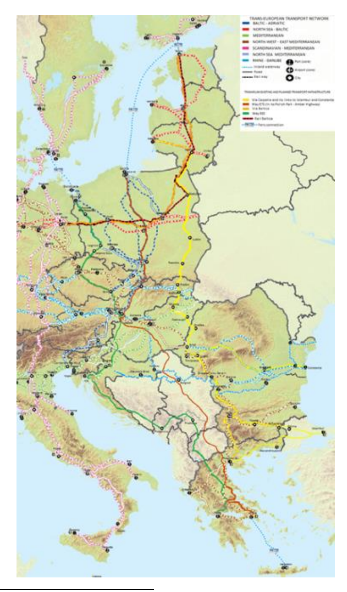
Figure 2. Trimarium existing and planned transport infrastructure.<sup>14</sup>

<sup>14</sup> "Trans European Transport Network (Ten-T Corridors)," Reddit, <u>https://www.reddit.com/r/europe/comments/3aq81n/transeuropean transport</u>.<u>network tent corridors/.</u> Accessed 7 June 2021.