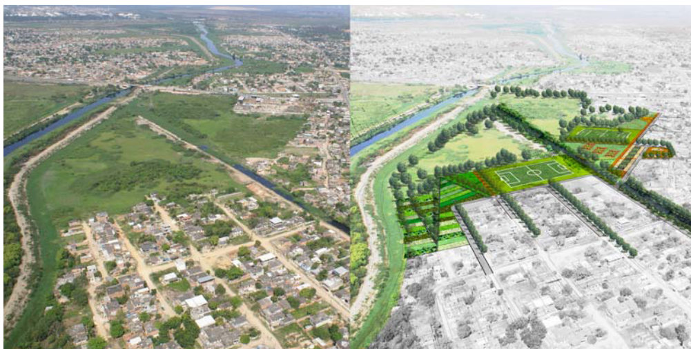
Fig.2 – Opportunities of intervention. Remaining open spaces along the rivers. Sarapuí River