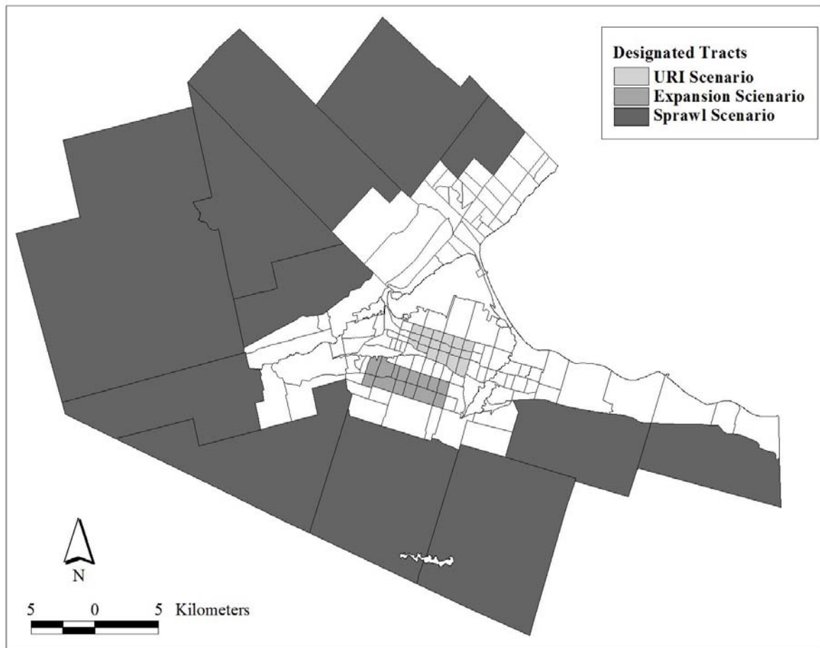
Fig. 2 – Designated census tracts for residential land development in the Hamilton CMA

capture this effect, we evenly distribute the new dwelling far away from the core in tracts that are at the fringe of the city, as shown in Figure 2.