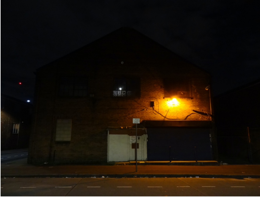
Figure 7. Chatley Street, Cheetham Hill, Manchester, 8 April 2021. Not everyone out and about in the city after dark is working in the same way and there still endures surreptitious forms of pleasure seeking. There have been a number of illegal raves, pop-up bars, and parties occurring in this district which despite being close to the city centre appears hidden in plain sight as an area for covert activities.