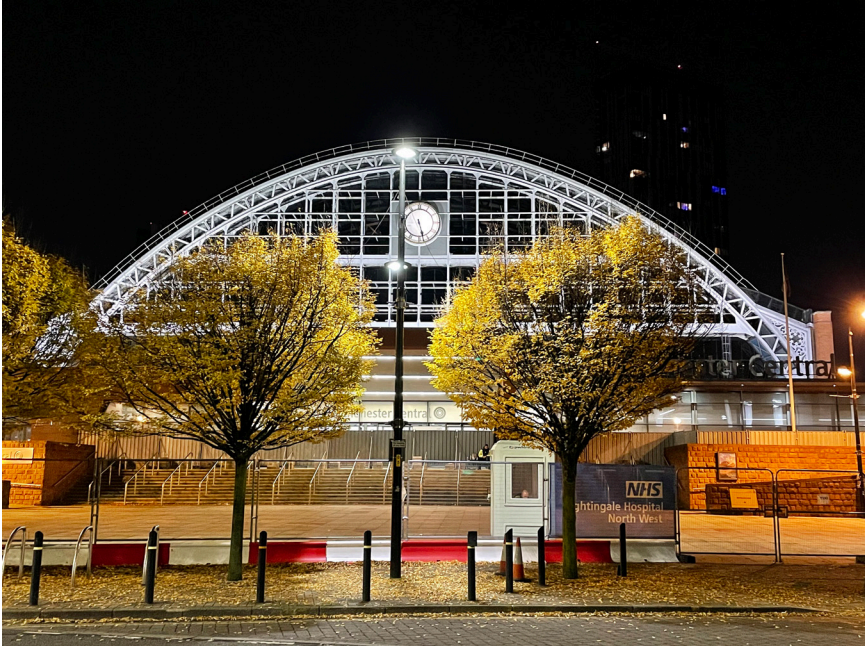
Figure 5. Nightingale Hospital North West, city centre Manchester, 8 November 2020. This image taken during the second national lockdown shows a security guard inside the booth, one of only five people I encountered during six hours in the city centre that night. The others were a streetcleaner and three female health workers returning home from work. Such nightwalks were also notable for the amount of wasted artificial light in the city.

(Shaw 2018: 3). When we seek to consider how our patterns, rhythms, and confrontations co-produce the city after dark, what methods are available to explore these coexistences? Walking is well established as a methodology for creative practice (Solnit 2000; Careri 2002; Middleton 2010; O'Neill and Roberts 2020), bringing together the body and landscape, their rhythms, and multisensory interplay. If we seek to account for how the night is moved through and how it moves through us, then the perambulatory autoethnography afforded by nightwalking can be valuable. Nightwalking here is positioned as a mobile method that can reveal empirical sensitivities and new avenues for critique (Büscher and Urry 2009) pertaining to the city after dark – how and why it is constituted and by whom. The 'who' in such processes is crucial. Jacques Rancière (2009 [2000]: 13) explains how making sense of a sense is inherently political since it concerns, "what is seen and what can be said about it, around who has the ability to see and the talent to speak, around the properties of spaces and the possibilities of time." Responding to this latter point, although my nocturnal praxis aims to give expression to different presences of the urban night and thus begin