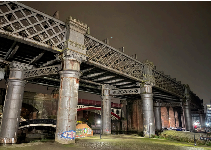
Figure 4. LED streetlighting, Castlefield, Manchester, 8 November 2020. In the twenty-first century, this type of artificial illumination has become a popular choice for cities wanting to reduce their lighting energy costs though their impact also has multiple negative effects on human health and biodiversity, significantly altering the character of the urban night.