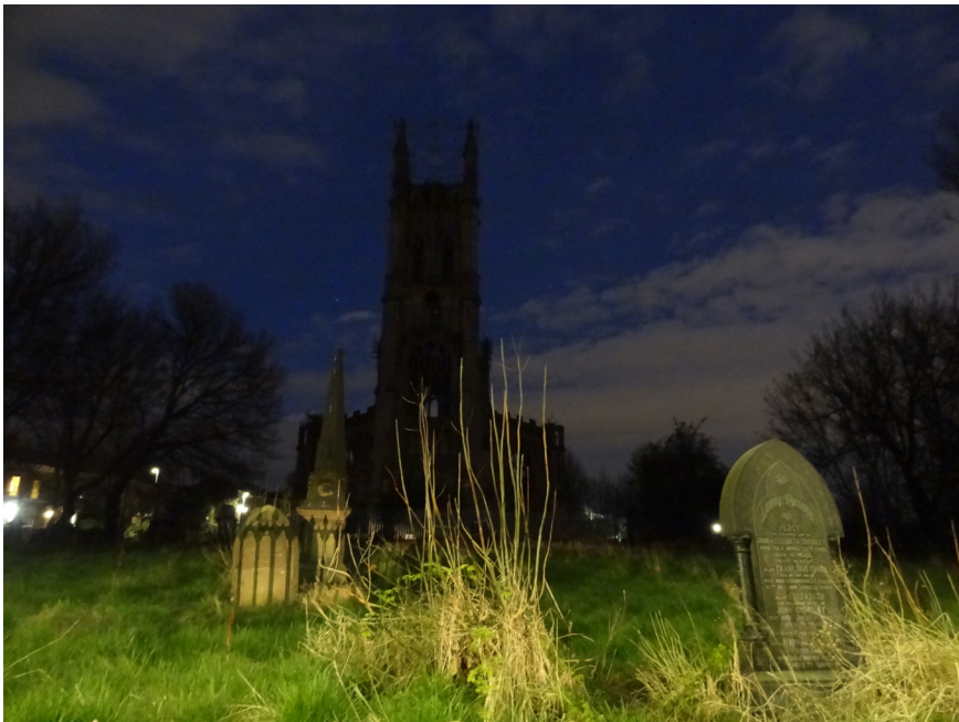
Figure 6. St Luke's Church, Cheetham Hill, Manchester, 8 April 2021. Gig economy workers made use of spaces close to this derelict church as sites for respite and recuperation when normally outside of lockdown it would be hazardous to do so due to the presence of young people partaking in underage drinking and drug-taking.

Turning back into the city centre, it is striking how being hidden in plain sight, Cheetham Hill is both a promise and premise. It offers countless opportunities for reinvention in its environs and the ability to have encounter and exchange with a diverse and mobile set of cultures and identities (Figure 7). Its steadfast refusal to acquiesce to the planned power of the city and the latter's ongoing quest for an urban renaissance of renewal have led to its character as much as the forces of late capitalism have shaped its offer of cheap and counterfeit goods, shady operations, and both legitimate and illicit provisions to the wider population. With the return of LED-illuminated hues in the sky, the very radiance of the city centre, it is time to leave the early hours of the urban landscape behind for another night.