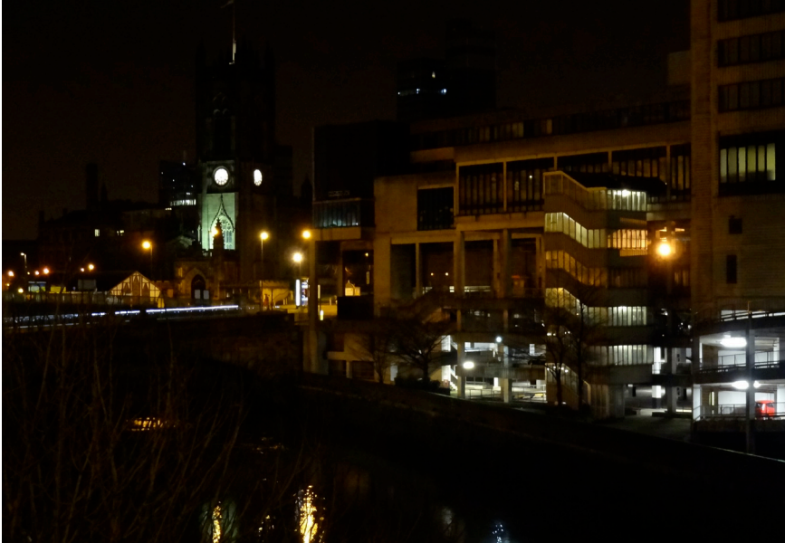
Figure 1. Blackfriars Street, looking towards Manchester city centre, 26 January 2014. The view shown here no longer exists since the sodium street lamps have been replaced by LED lighting.