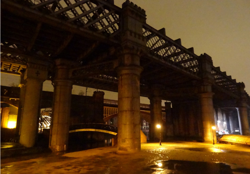
Figure 3. Sodium lamps, Castlefield, Manchester, 26 May 2016. The quality and quantity of this form of artificial illumination was commonplace in many cities by the second half of the twentieth century.