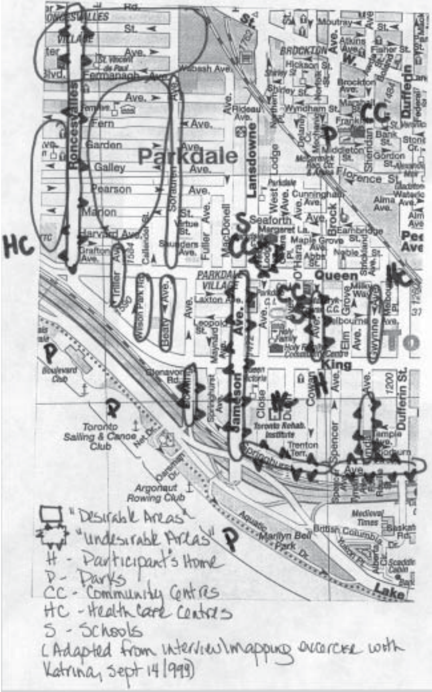
Map 3: Katrina's Parkdale Participatory Map