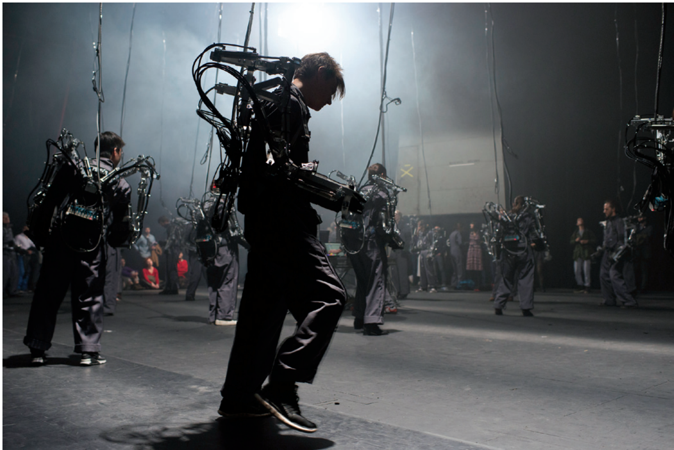
Bill Vorn, Inferno , 2015. Festival Exit 2015.

Loosely inspired by the robotic orchestras of the '90s, such as Chico MacMurtrie's Robotic Opera or Matt Heckert's Mechanical Sound Orchestra , the Copacabana project features not only musical machines but also acting and dancing robots onstage. My goal is not to imitate a genuine variety show, but to give an extravagant, metaphorical response to the question: "What would happen if machines took over the stage of a cabaret?"