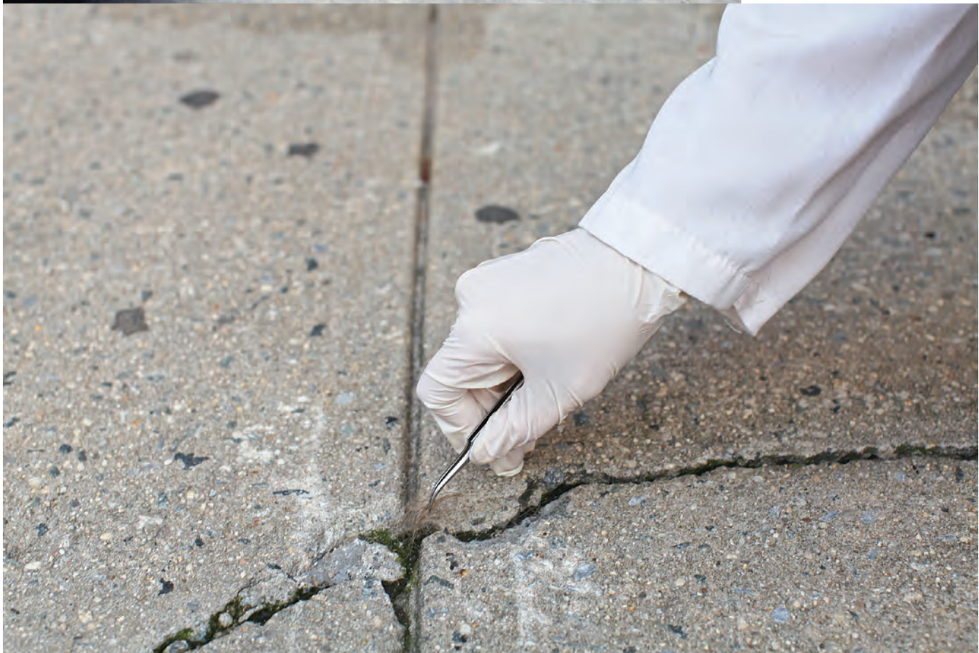
Heather Dewey-Hagborg, Hair Collection, Stranger Visions, 2013.