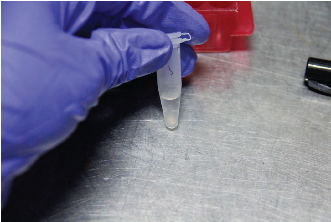
Heather Dewey-Hagborg, Genspace (DNA laboratory), Stranger Visions, 2013.