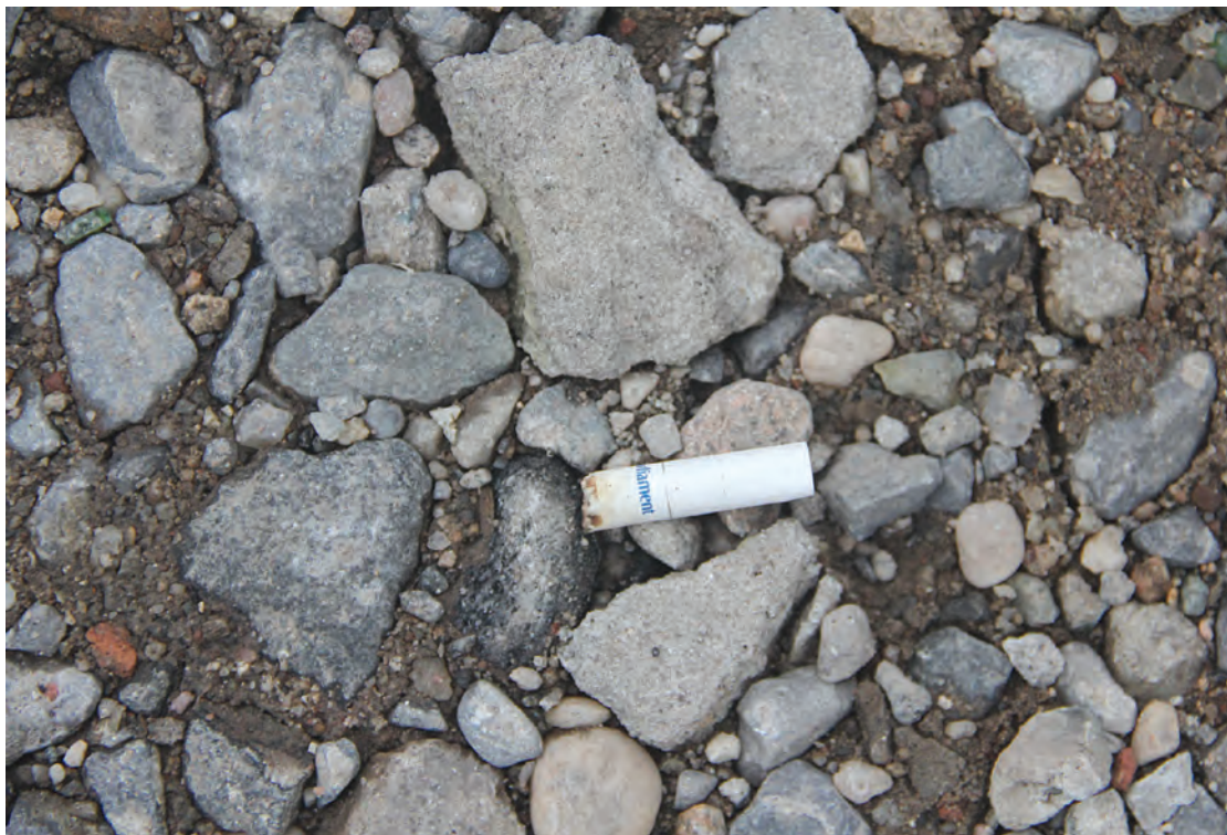
Heather Dewey-Hagborg, Sample 2 – Close Up, Stranger Visions , 2013.