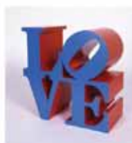
Robert Indiana Love , 1966