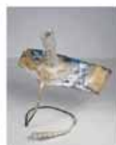
Franz West Pygmalick , c. 1980