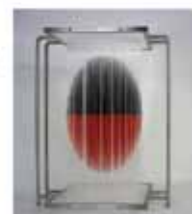
Jesus Rafael Soto Oxide Medians Negro y Rojo , 2003