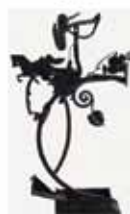
Jean Tinguely Cocktail au Choclat , 1966