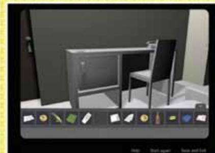
Studer / van den Berg