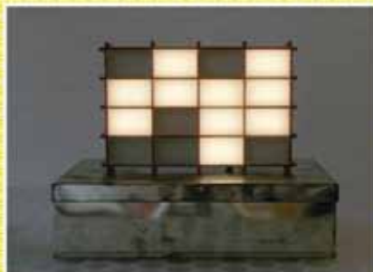
Atelier Hauert Reichmuth