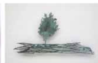
Kiki Smith Rabbit , 2004