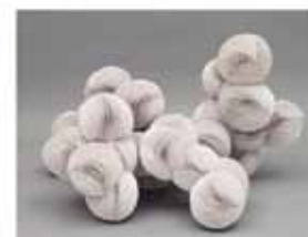
Tara Donovan Untitled (Paper Plates) , 2006