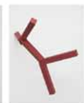
Joel Shapiro untitled , 2011