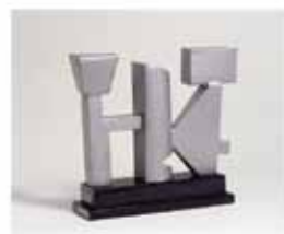
David Smith The Unity of Three Forms , 1937

Most Similar | Kinetic Sculpture | Open Form Sculpture | Suspends/Hanging | Interactive | Biomorphic | Formal Elements | For Sale