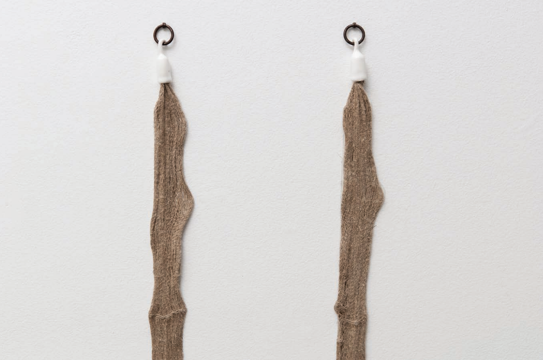
Beth Stuart, Stanchions for E.H./Immanent collapse , 2012, spranged linen, porcelain, iron hooks, gesso, acrylic paint, image courtesy the artist, photography: Paul Litherland.

dictate where they are placed and how they relate to each other – and how we relate to them. Stuart is a seeker of liminal states, which have multi-tiered suggestions for the reading of her work.