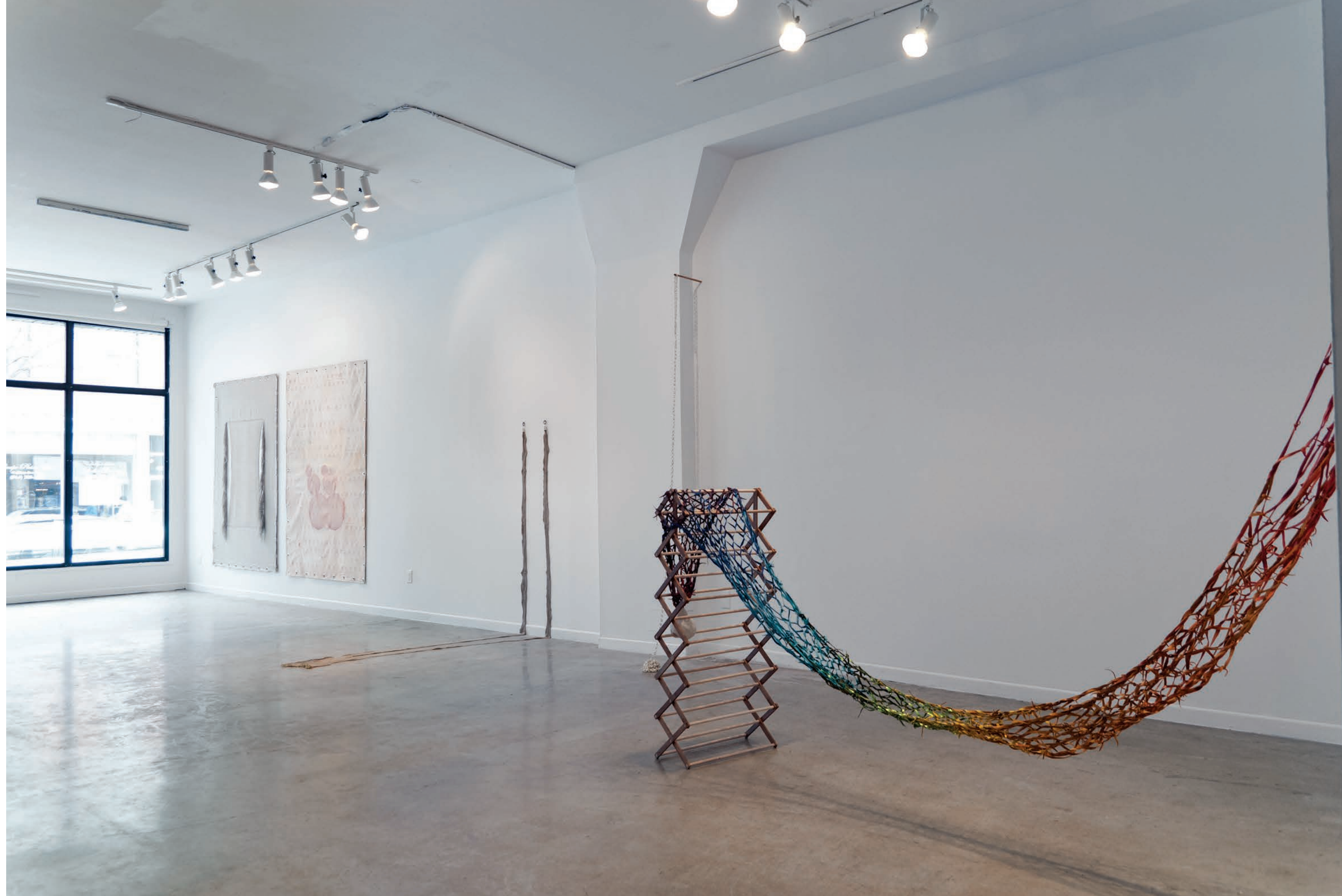
Beth Stuart, Installation view, What Bonds Are These? , La Centrale Galerie Powerhouse