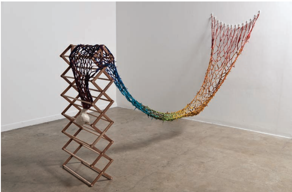
Beth Stuart, Stanchions for E.H./Thingdu , 2012. Spranged handcut leather, maple, walnut, unique porcelain vessel, unique glazed porcelain hooks.