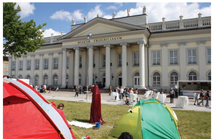
Occupy Documenta outside Friedrichsplatz, 2012.