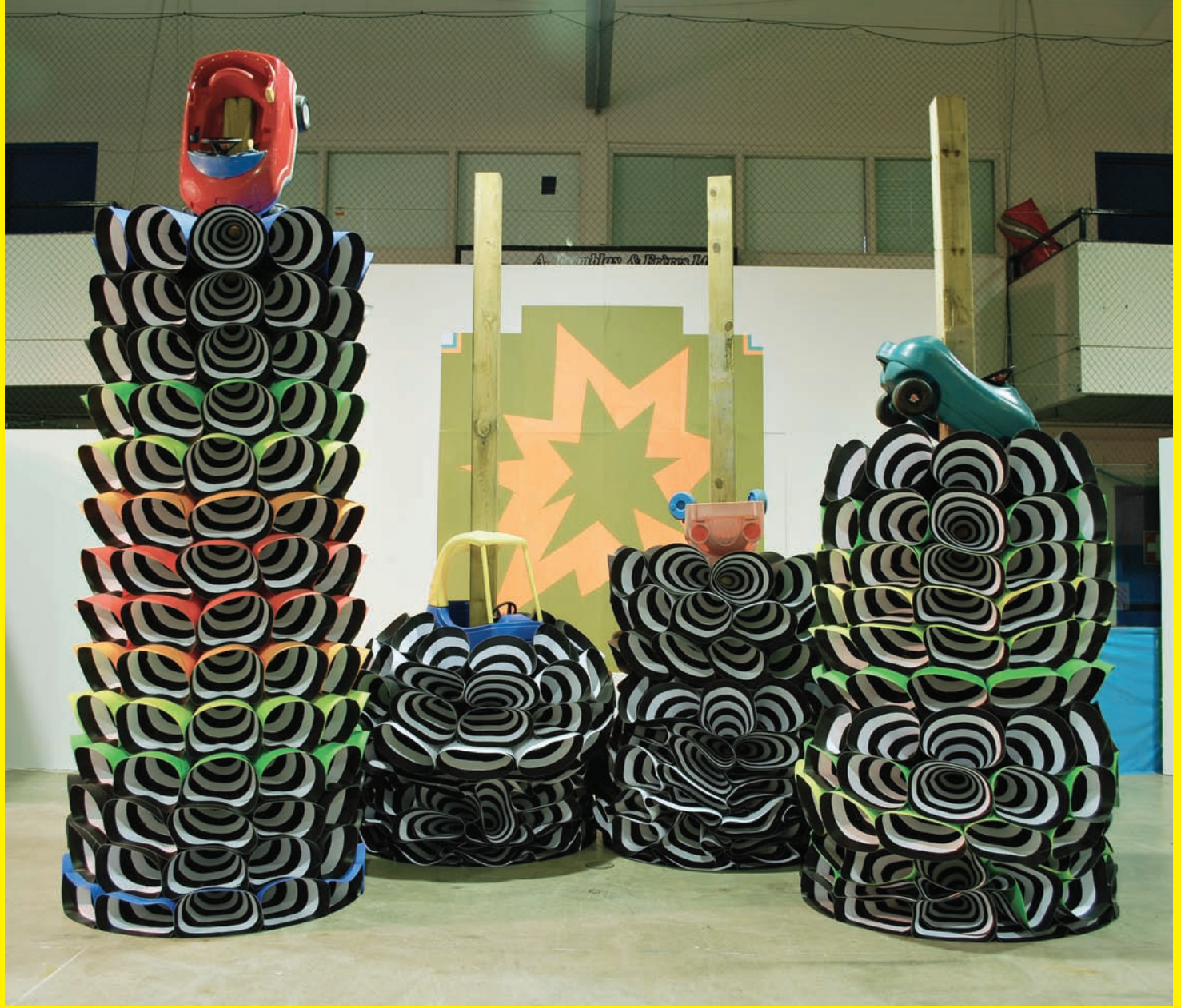
Seripop, You Should Be Able to Read It From 30 Feet Away in a Car Going at 50 km/h , 2010 ; Screenprinted paper, lumber, plastic toys , 304,8 x 487,6 x 365,7 cm. Photo: Seripop.