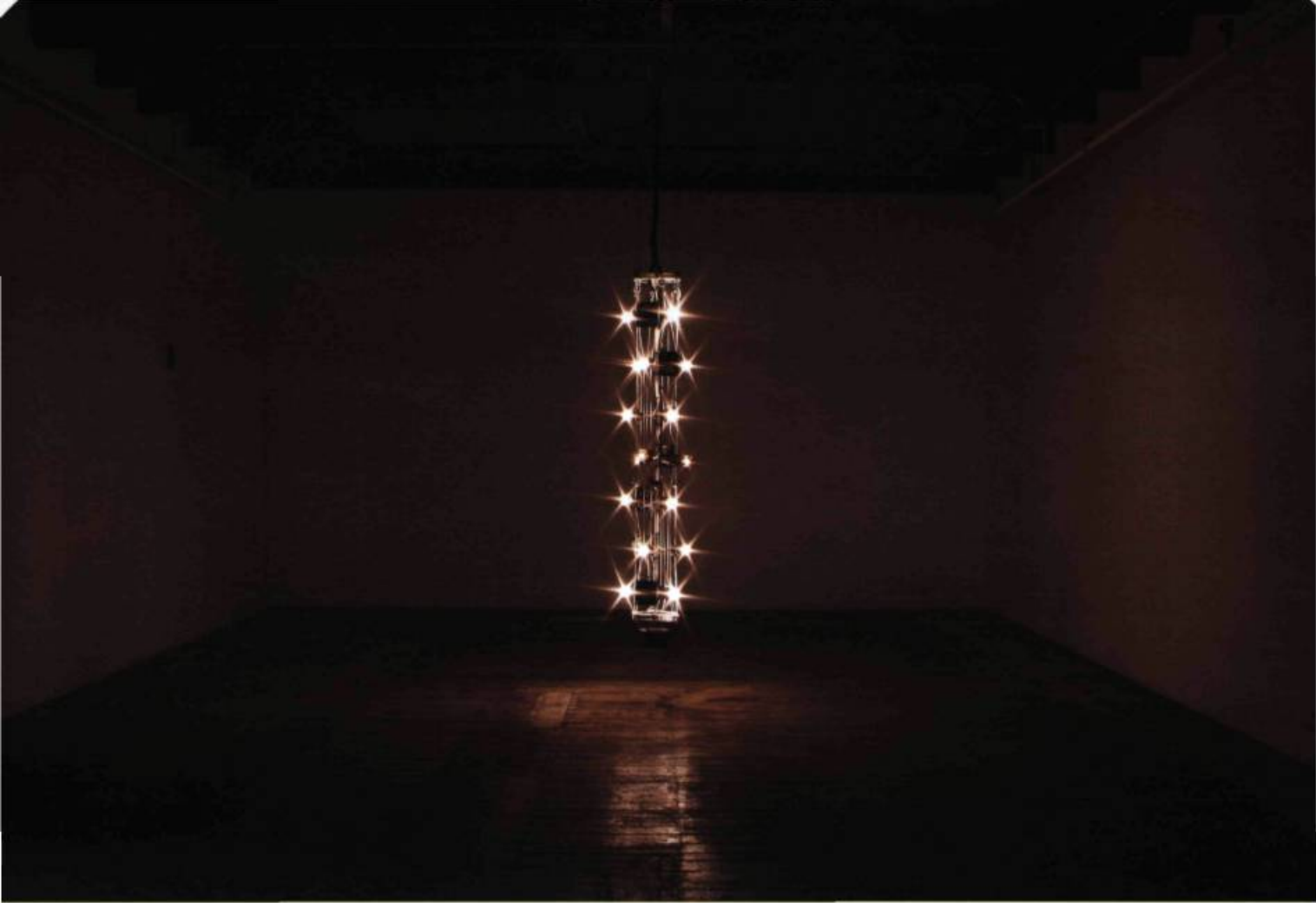
Sofian Audry, Jonathan Villeneuve, sound concept: Myriam Bessette, Trace I , 2007. Aluminium, 21 bulbs of 40 watts, speakers and bass amplifier, proximity sensors, audio amplifier, MIDI device, computer. Diameter: 12, 7 x 30 cm 4.

by soliciting their active participation in the creation of the work. Often predicated on the re-framing of everyday objects (a pile of multicolored individually wrapped candies weighing in at 175 pounds which metaphorically stands in for a body, as in Felix Gonzales-Torres' Untitled (Portrait of Ross in L.A.) , 1991 or events (for example the communally prepared and shared meals of Rirkrit Tiravanija), relational work seeks to create art experiences in subtle, cumulative micro-events. Relational art is the logical conclusion of a coupling of conceptual art and Fluxus, owing much to early performance art practices.