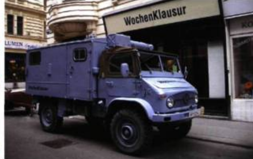
WochenKlausur, Community development "From Place to Place", 2001 Mobile laboratory.