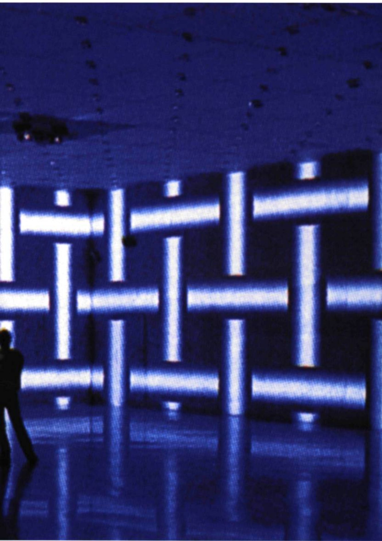
Peter Kogler, Untitled Installation , 2002. DVD sound track projection.