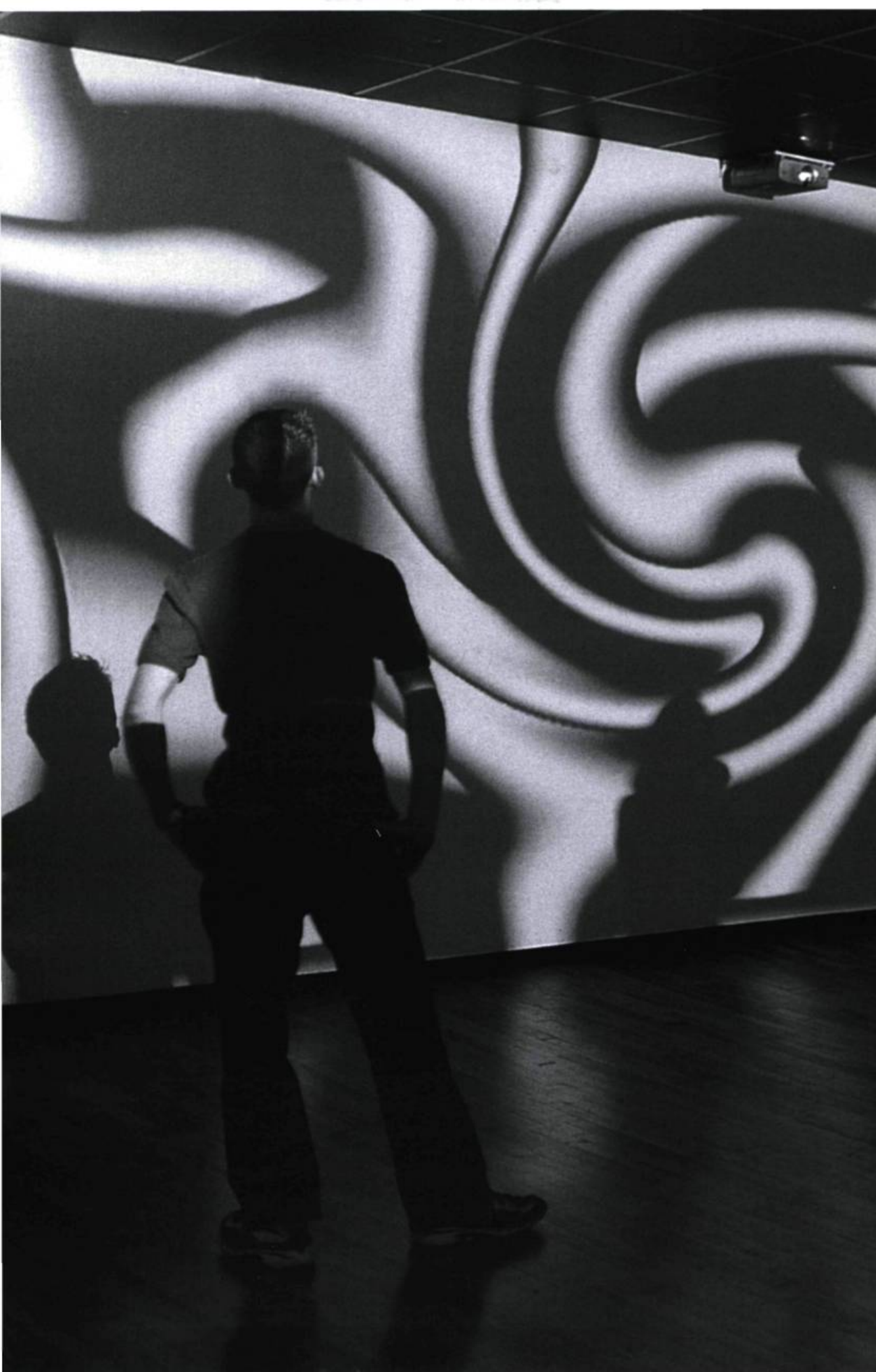
Peter Kogler, Untitled Installation , 2002. DVD sound track projection.