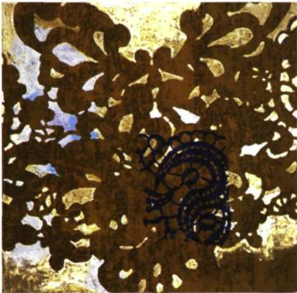
Harlan Johnson, Festoon 10 , 2000. Acrylic on canvas, 71 x 71 cm.

F estoon, an exhibition of Harlan Johnson's recent paintings was held at Galerie Trois Points in Montréal in the autumn of 2000. The gallery is located on the fifth floor of the Belgo building above Sainte-Catherine Street. Thus to visit the exhibition one had to traverse an active retail thoroughfare with its advertising panels and shop windows of electronic displays. Approaching the building that houses the gallery, one walked by a plethora of digitally reproduced imagery, through a visual environment of multiple copies. Walter Benjamin's effect of technological reproduction always comes to mind in these vibrant commercial settings, where the aura of any original idea has been watered down through endless processes of duplication.