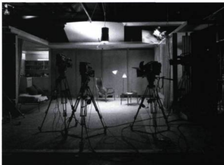
Stan Douglas, Set for Win, Place or Show (East View) , 1998. Colour photograph.