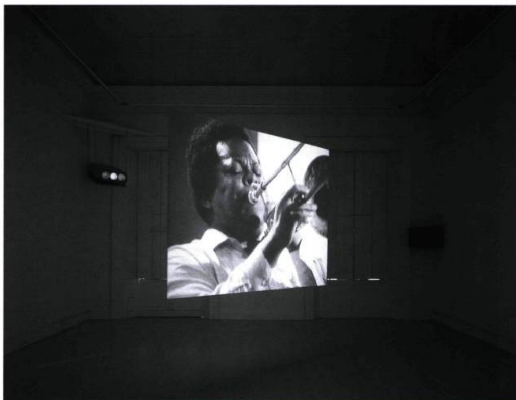
Stan Douglas, Hors-champs , 1992. Installation, photograph by Stan Douglas. Courtesy Vancouver Art Gallery.

Stan Douglas, Vancouver Art Gallery. February 27 - May 24 1999. The Edmonton Art Gallery (June 25 - August 24 1999), The Power Plant (September 24 - November 21 1999) 1