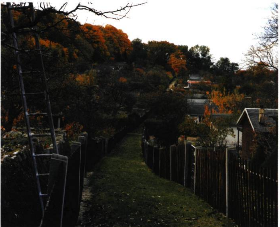
Stan Douglas, Pat Through "Berg Auf", Am Pfingstberg, Pfingstberg , 1994. Colour photograph.