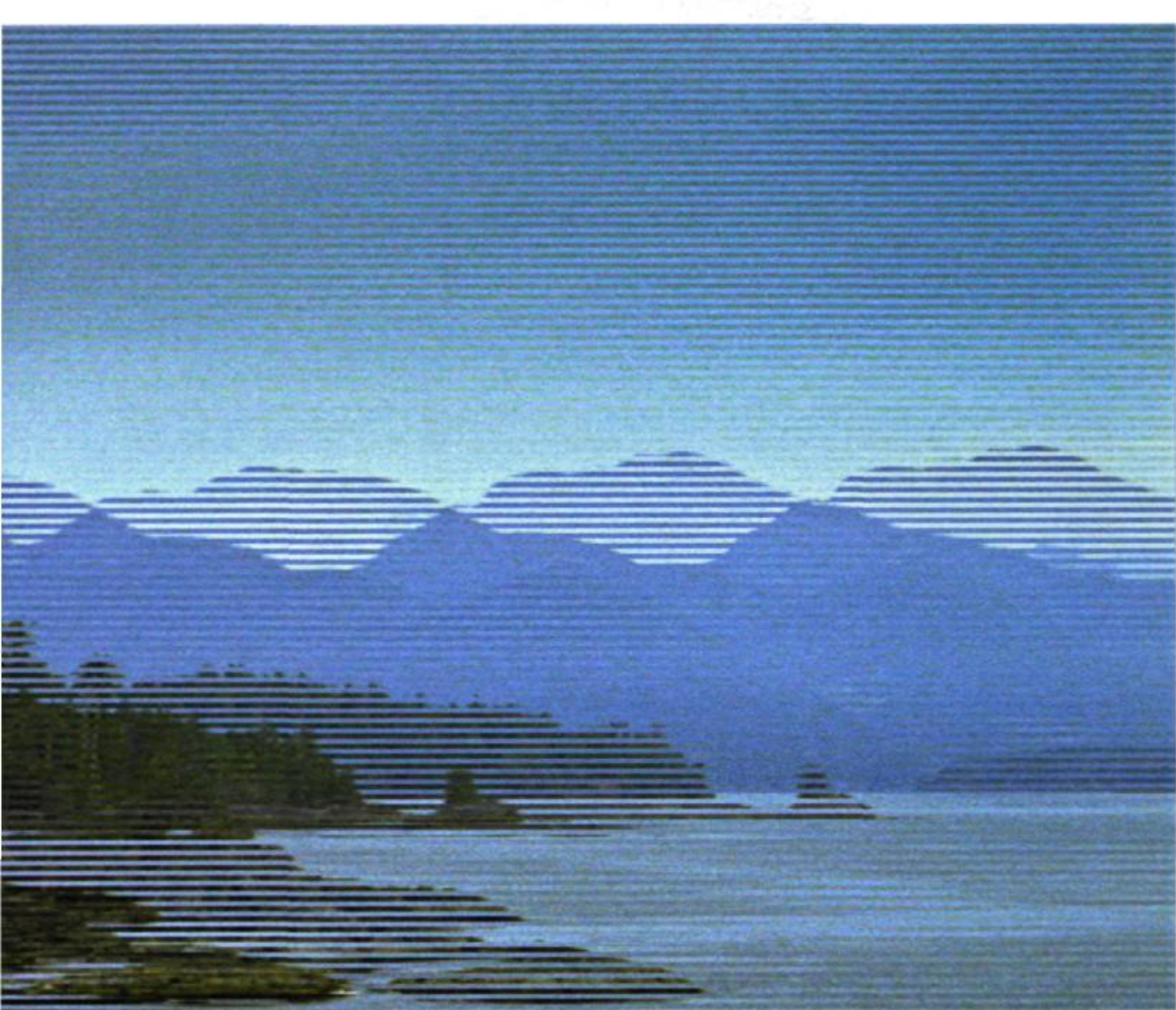
Stan Douglas, Nu.ka , 1996. Video still. Courtesy Vancouver Art Gallery.

sides of the picture is metaphorically consistent with the era's call for choosing a stance and a place.