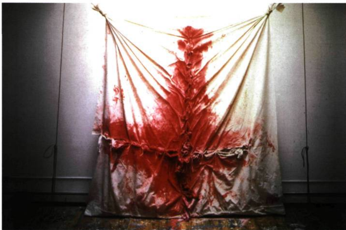
Cosimo Cavallaro, Birth # 6 , 364 x 455 cm.

Cosimo Cavallaro, No England/No Amsterdam II , Real Art Ways Gallery, Hartford (Connecticut). May 17 - July 6, 1997