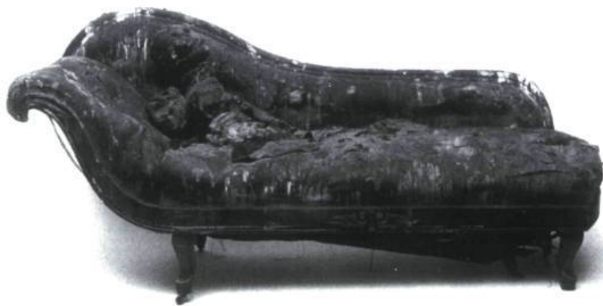
Bruce Conner, Couch , 1963. Cloth-covered couch with wood frame, paint, cloth, paint. Norton Simon Museum, Pasadena, CA.

seeking kicks and love and satori, getting high on jazz and junk and booze and poetry.