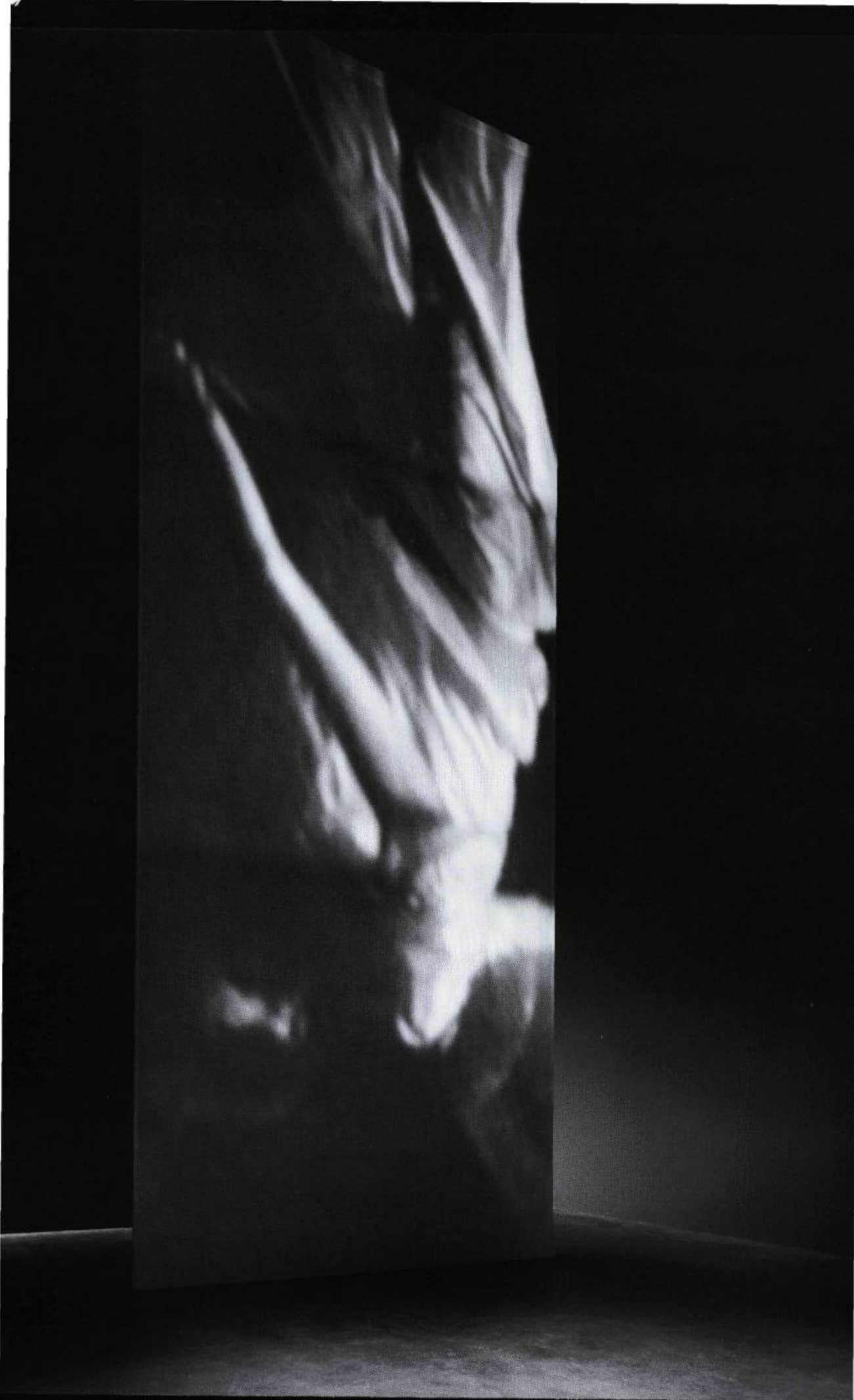
Bill Viola, The Arc of Ascent , 1992. Video/sound installation. Collection and courtesy : Ydessa Hendeles Art Foundation, Toronto.