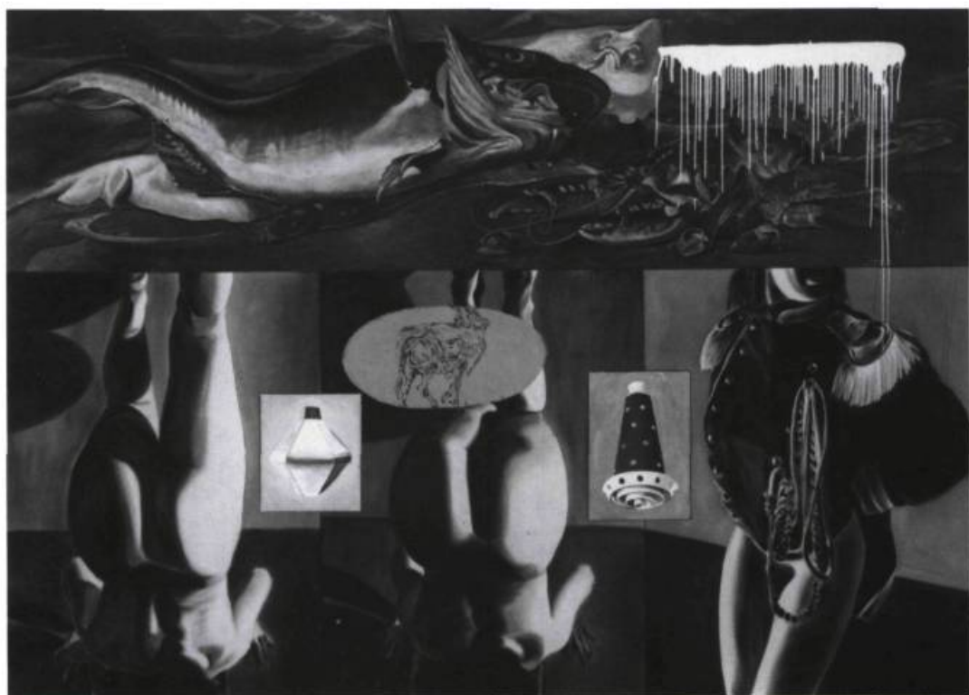
David Salle, Epaulettes for Walt Kuhn , 1987. Acrylic, oil on canvas, linen; 96 x 133 1/2 in.