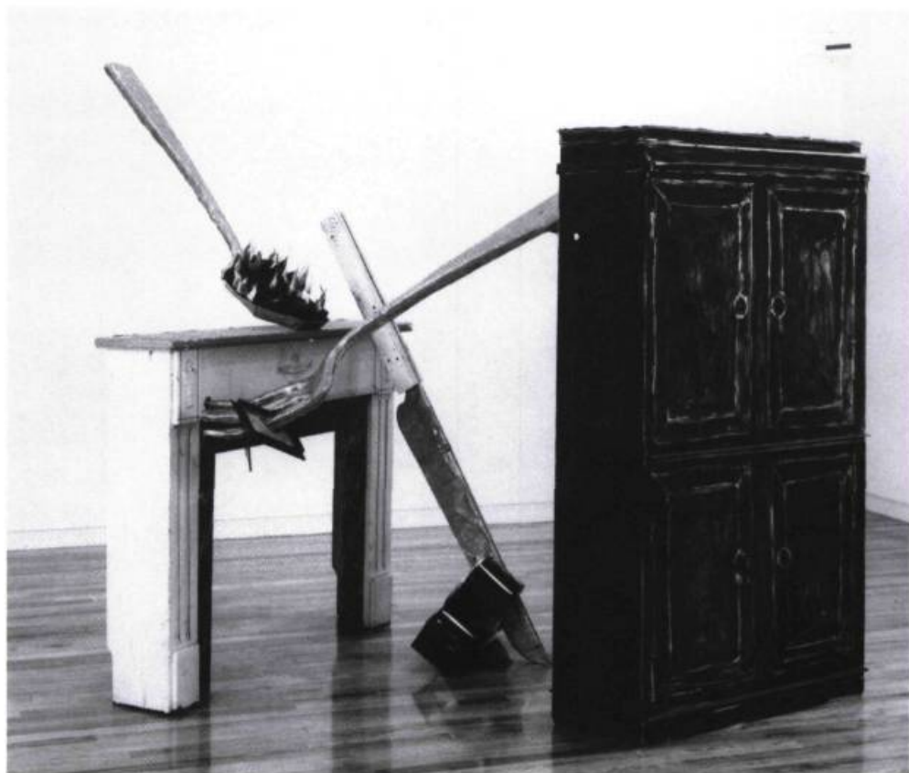
Bill Woodrow, Empty Grate , 1987. Wood, aluminium duct, enamel and acrylic; 81 x 86 x 80 in.

becomes a kind of litany. Burden also notes if the submarine is nuclear powered and one effect of the piece is to make us more aware of the missile-laden vessels constantly moving around under the ocean and the polar ice-caps, ready at a moment's notice to unleash their destructive missiles. Burden addressed this subject in his 1981 piece, Reasons for the Neutron Bomb in which he used coins and matchsticks to represent the 50,000 Russian tanks which the neutron bomb was supposed to protect us against. Although its subject and means were unorthodox, All the Submarines of the United States of America accomplished one of the chief tasks of art, to make the unseen visible, and it did so with a mixture of fascination and fearfulness that was just as memorable, and a good deal more interesting, than Burden's earlier gunplay.