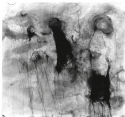
Sylvia Safdie, Goreme No. 9 , 1987. Mixed media on paper.