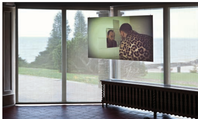
Exhibition view, Keren Cytter: Based on a True Story , Oakville Galleries in Gairloch Gardens, Oakville, 2012.