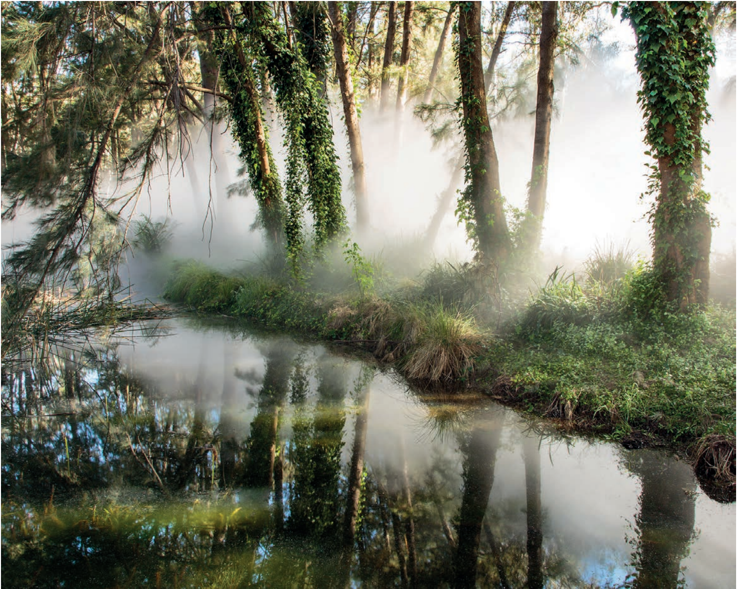
Fujiko Nakaya , Foggy wake in a desert: An ecosphere , 1982. National Gallery of Australia, Canberra, initial version purchased in 1977. © Fujiko Nakaya.