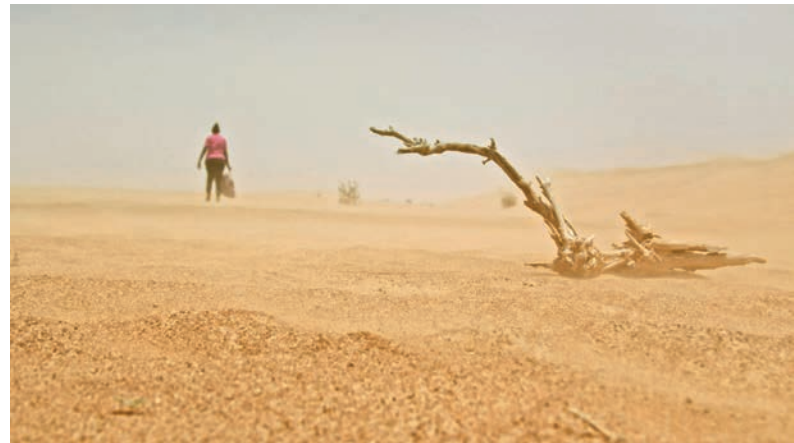
John Akomfrah , Four Nocturnes , 2019. Stills of the three channel HD colour video installation, 7.1 sound.