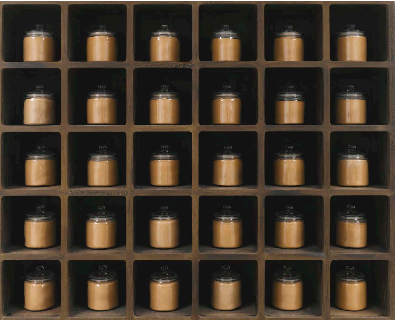
Ai Weiwei , Dust to Dust , 2008. Powder from grinded Neolithic pottery (5000 – 3000 BC), glass, and wood, 200 x 240 x 36 cm.