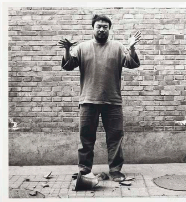
Ai Weiwei , Dropping a Han Dynasty Urn , 1995. Gelatin silver photograph. Three sheets: 180 x 169.5 cm (each). Purchased 2006. The Queensland Government's Gallery of Modern Art Acquisitions Fund. Collection: Queensland Art Gallery | Gallery of Modern Art. © Ai Weiwei.

Ceramics are an ideal case study in the aesthetics of destruction. While a ceramic object can be preserved for centuries, it is always haunted by the chance that it might slip from unsteady hands or fall from an exposed shelf. The conceptual resonance of this fragility has long been esteemed in China—a nation so closely tied with ceramics that country and material are synonymous in the Anglophone imagination—and many Chinese artists have adopted ceramics to reveal the destruction inherent to contemporary society. Ai Weiwei and Liu Jianhua are among the most renowned proponents of this aesthetic. From the 1990s to the present, both have used ceramics to expose acts of violence that far exceed a simple smashing of vases, ranging from planned obsolescence, environmental degradation and ecological cycles of decay and renewal, to the redemptive power of destruction as a crucible for regeneration.