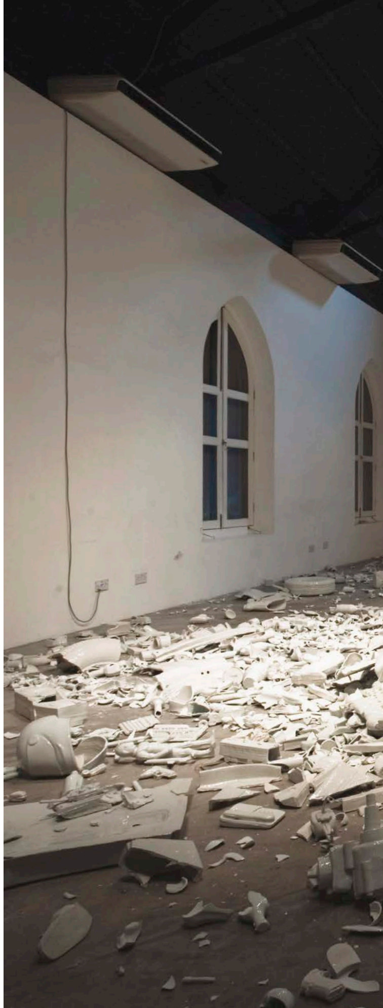
Liu Jianhua, Dream , 2006. Sculpture Square, Singapore, Qingbai glazed porcelain, 3-channel DVD projection, 1200 x 900 x 80 cm.

Liu returned to this theme with Discard (2011), an installation of shattered porcelain outside Shanghai’s Sino-Italia Design Exchange Centre that blurred distinctions between landfill and archaeological excavation. For this work, Liu scattered his replica commodities in a cavity of earth and paired them with a mass of broken Ming and Qing Dynasty ceramic reproductions, deposited in an adjacent pool of water. The implication of this is clear: alongside simulated remnants of earlier eras, Liu’s porcelain commodities were imbued with an eerie ethereality, reminding viewers that even those things we consider most contemporary will become relics of a long-forgotten antiquity. At the same time, his excavation’s resemblance to a landfill made the after-effects very clear that the planned obsolescence on