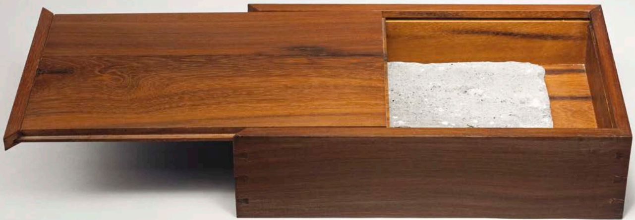
Ai Weiwei , Souvenir from Beijing , 2002.