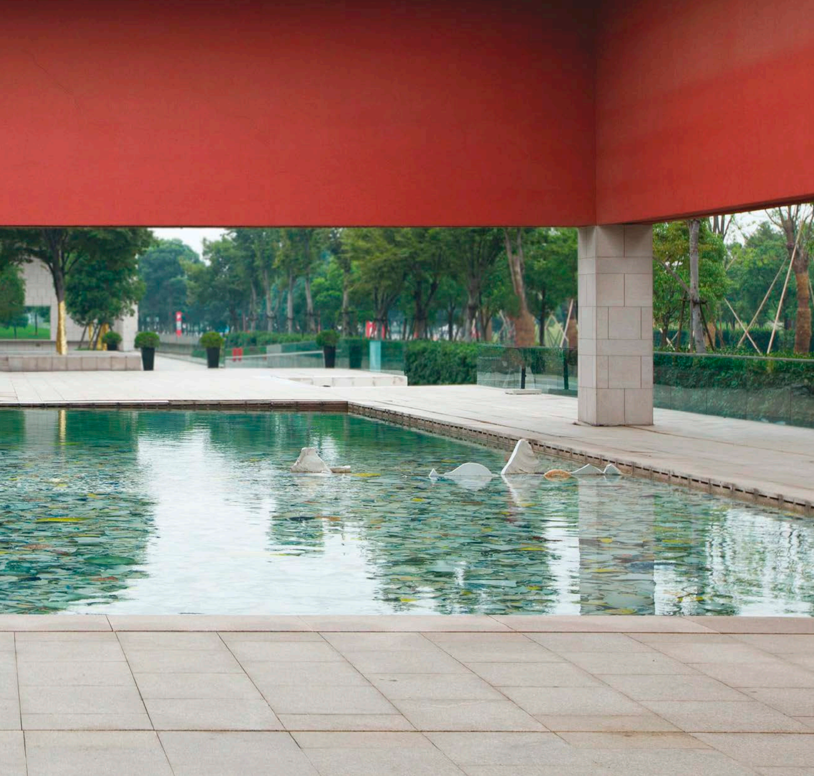
Liu Jianhua , Discard , 2011. Sino-Italia Design Exchange Centre, Shanghai, installation of broken reproductions of historical porcelain vessels, variable dimensions.