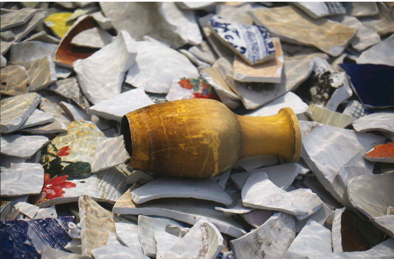
Liu Jianhua , Discard (details), 2011. Sino-Italia Design Exchange Centre, Shanghai, installation of broken reproductions of historical porcelain vessels, variable dimensions.

Han Dynasty Urn and Souvenir , Ai shatters our idealised abstractions of history by exposing the traces of the past within the present, both aides-mémoires and catalysts for change. In his many variations of Regular-Fragile , Liu blurs past, present and future, drawing a forceful comparison between the capitalist rhetoric of progress and the inevitable fact that even the highest ambitions will one day be forgotten and discarded. The final word on the subject, however, falls to Dust to Dust and its reference to the regenerative potential of destruction as harbinger of a new era, in which humanity may or may not play a role, depending on the choices we make now to accelerate or temper our consumption of the world's resources.