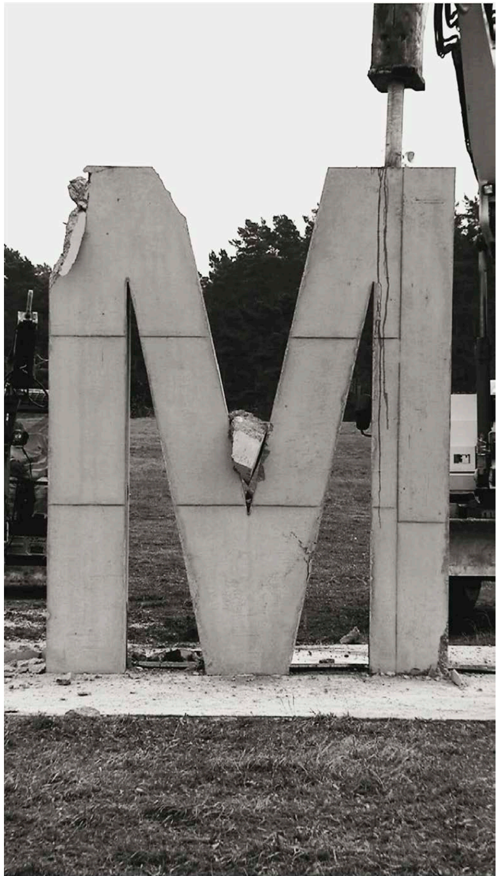
Santiago Sierra, Destroyed Word (details), October 2010-2012.