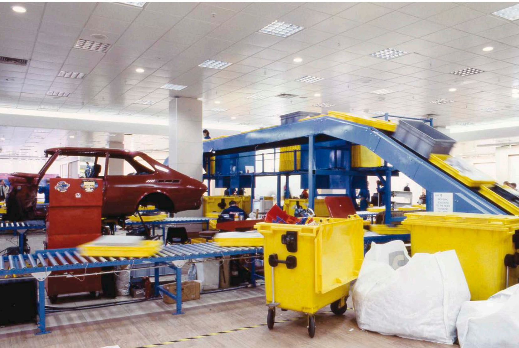
Michael Landy, Break Down, 2001. Installation view. An Artangel commission. Courtesy of the artist and Thomas Dane Gallery. © Michael Landy.