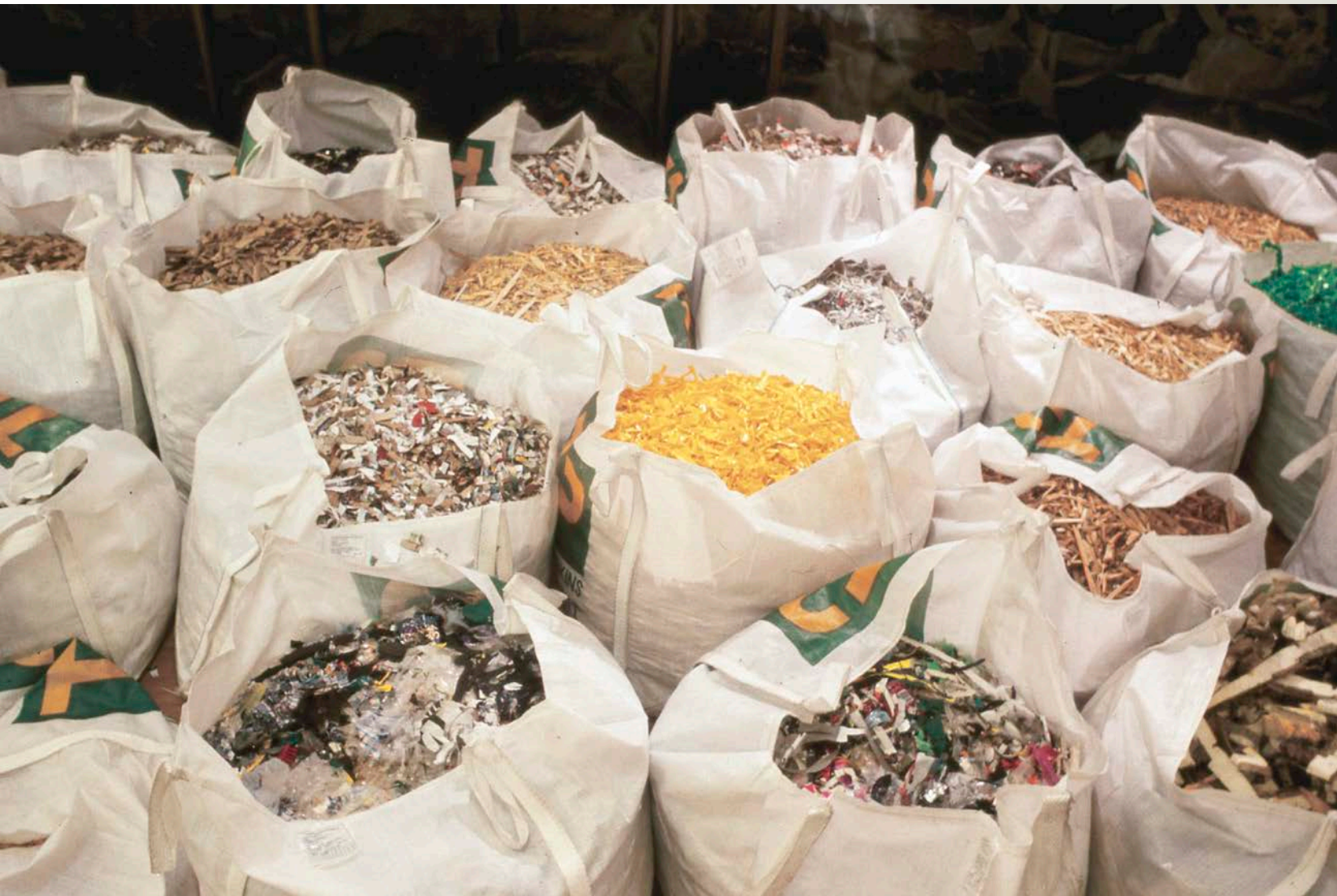
Michael Landy, Break Down, 2001. Installation view. An Artangel commission.