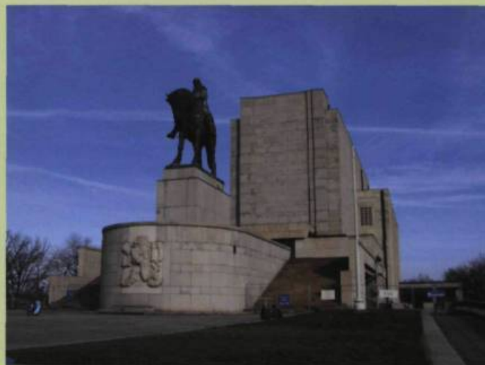
Bohumil KAFKA, Jan Zizka monument, ca. 1950. The statue itself is 9 meters high; height including pedestal is 22 meters. Prague.

Kafka's statue was ceremoniously erected on July 14, 1950 within a far different ideological context than that of its initial conception. Following their 1948 coup d'état, the communists commenced an Orwellian rewriting of Czech history. Stalin's party line was amenable to Zizka as a secularized symbol of Pan-Slavic