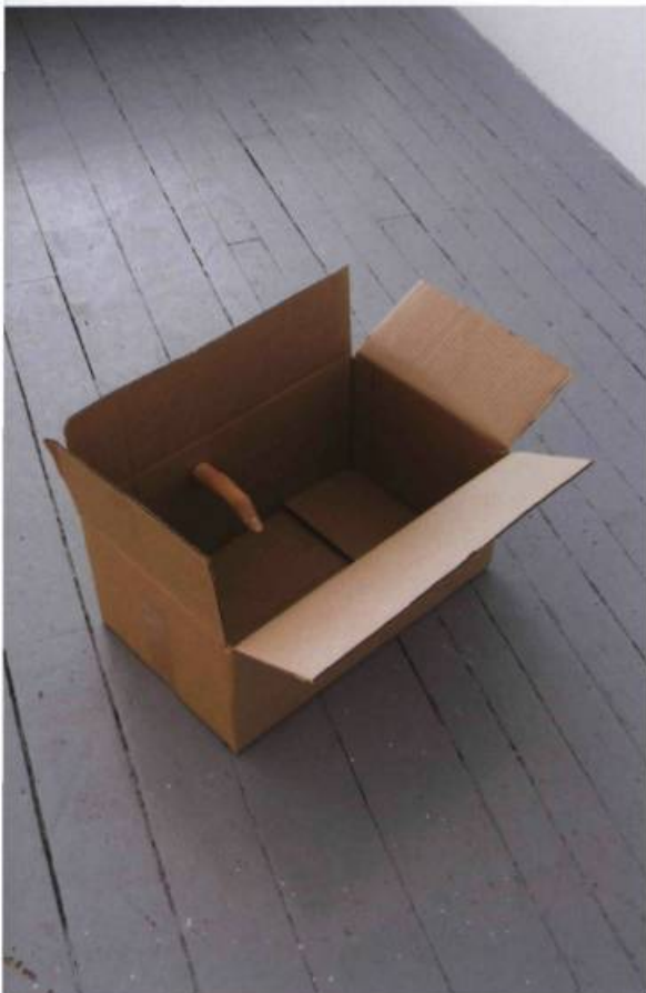
David ARMSTRONG SIX, Your Sadness Equals My Sadness And So On , 2008. Carved wood, cardboard box. 11 x 22 16 inches.

same time announcing, perhaps, some other terrible or sorrowful calamity. A comedic accent to offset the overbearing excesses of its neighbour? It could be, since the thing wouldn't seem out of place amongst the macabre gags and other necrophilia one might expect to find in something like the Addams family's attic. One could imagine that the thing, the finger that is, as being more or less alive, and that, being constrained to the insides of the box, gets transported from venue to venue—under the arm of the artist, its master, no doubt. A mobile quasi-object, a joker of sorts, its only function is to point. But to what does it gesture? To the centre of the interior of its prison of course, the set piece of which we now have the privilege to view from the outside. But this stage, this theatrical opening, has no outside. That's the joke, and it isn't particularly amusing. Why? Because it doesn't really exist. There are no walls, for in this labyrinth it is terror that holds court. And what is the nature of this terror? Let's just say that it comes