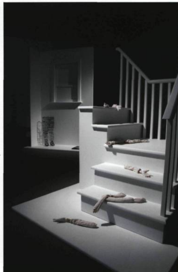
Vera JACYK, Chysto, Chysto, Chysto , 2009. Detail.

A blackboard drawing of a healthy child goose-stepping obediently suggests another grim aspect of the country's history. In the drawer lies a partially embroidered swastika. A child's lower torso and a woman stretched into agonized elongation are created from barbed wire. Two pysanky are positioned at a child-sized table where the artist, as a little girl, might have played quietly while hearing the silence and tension endured by adults around her, those who brought these histories and terrible memories to Canada. But these eggs are not coloured in the symbols representative of their culture, they are black with white