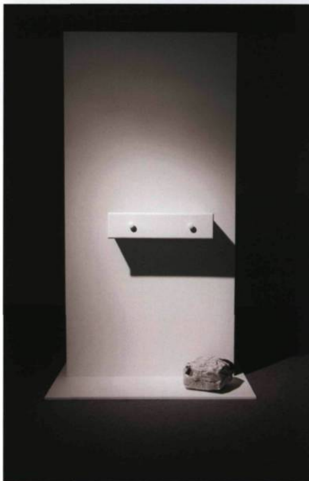
Vera JACYK, Chysto, Chysto, Chysto , 2009. Details.