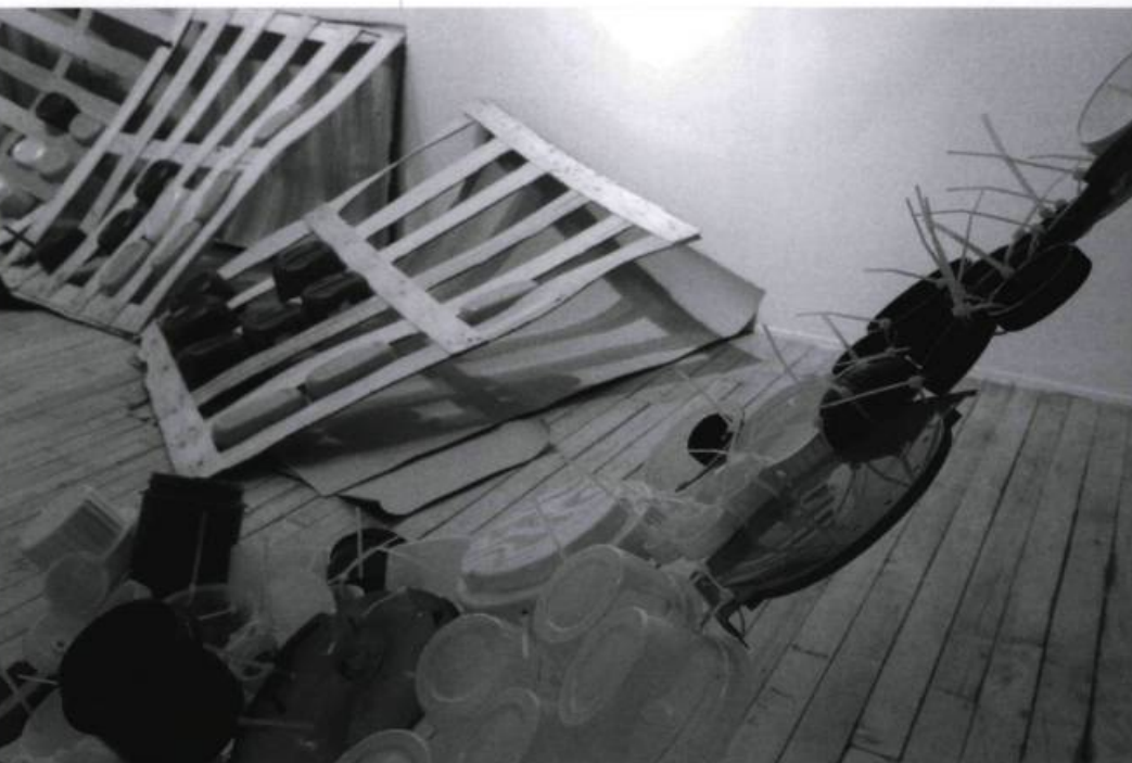
Laura ST-PIERRE, Dwellings , 2007. Detail. Mixed media installation.

St-Pierre uses both garbage and the gallery as her sculptural media. Dwellings sprawls across a spacious exhibition site covering roughly 240 square meters. Her choice of materials consists of brightly coloured, discarded household items, including white bleach bottles, orange and blue plastic jugs, green, red and pink plastic caps, as well as rickety fragments of wooden furniture. The artist transformed the gallery setting into a whimsical, playful landscape of ramshackle structures by incorporating strategic parts of the room into the materiality of the installations. Consequently, the works both partially cover and emphasize banal details