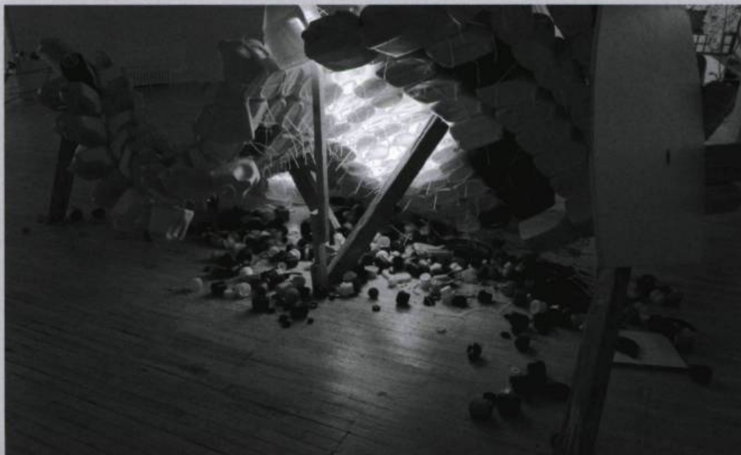
Laura ST-PIERRE, Dwellings , 2007. Detail. Mixed media installation.

Despite the levity pervading Dwellings , the works also probe the more troubling implications of household products. By recycling used objects, St-Pierre's work implicitly conveys an ecologically conscious critique of the materialism, expenditure and polluting waste of a post-industrial consumer society dependant upon disposable items. As critic Randall Anderson notes in the essay accompanying the exhibit, St-Pierre's work aims to "discover a