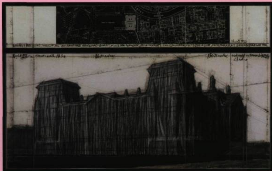
CHRISTO, Wrapped Reichstag, Project for Berlin . Drawing in two parts, 1982. Collection of George Weston Limited. © Christo 1982, 2005.

Interestingly, while their primary work involves architecture and the landscape, Christo and Jeanne-Claude have worked recursively, turning their sights self-referentially upon objects of pre-existing aesthetic purposes. With Wrapped Monument to Cristóbal Colón, Project for Barcelona (1984) and Wrapped Statues, Sleeping Faun "Barberinische Faun," Project for der Glyptothek-München (1984), the couple