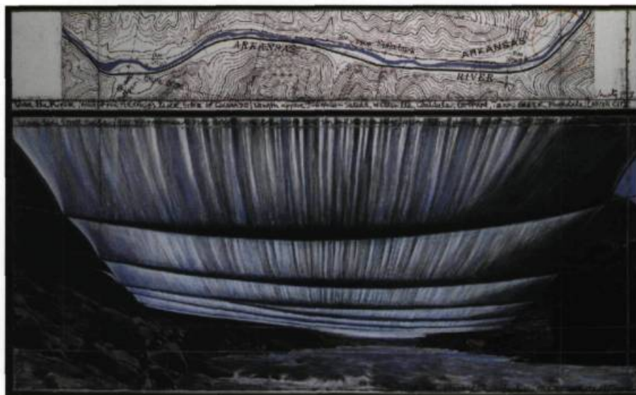
CHRISTO, Over the River, Project for the Arkansas River, State of Colorado. Drawing in two parts, 1993. Collection of George Weston Limited.