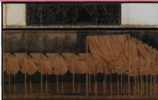
CHRISTO, The Gates , Project for Central Park, New York City. Drawing in two parts, 1985. Collection of George Weston Limited. © Christo 1985, 2005.

Christo and Jeanne-Claude: Works from the Weston Collection Art Gallery of Ontario, Toronto, Ontario January 22–May 15, 2005