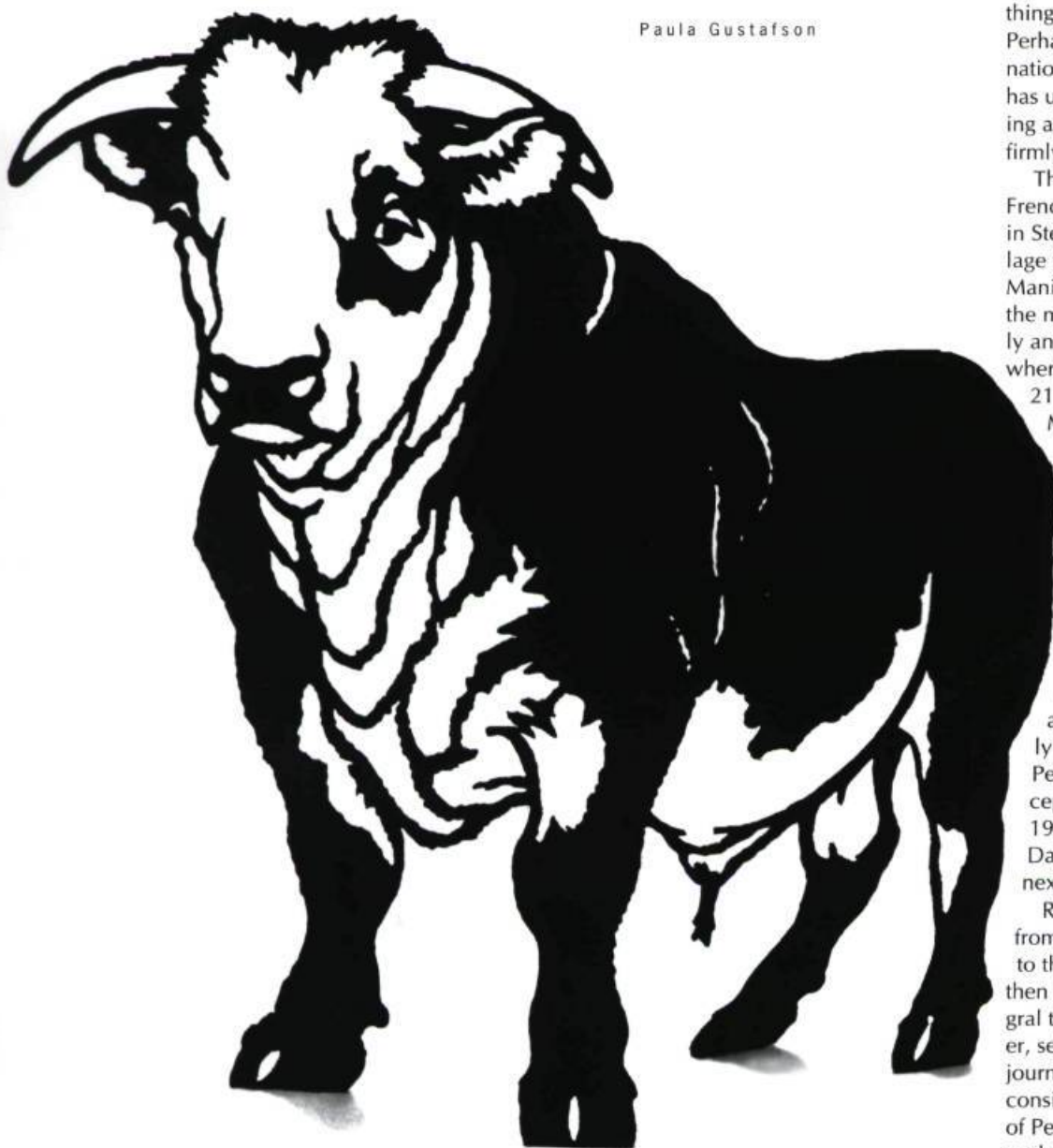
Joe Fafard, Sam I , 1993. Stainless steel, painted, 7/10, 13.7 x 13 cm. Collection of the artist.

O n the Prairies, cows are ubiquitous reference points. In a flattened landscape punctuated only by occasional bursts of trees, the slow-moving figures of cows serve as landmarks; something to look at, something to measure against sky and horizon. Perhaps that's why, again and again, internationally acclaimed sculptor Joe Fafard has used cows as both a method for working and metaphor that keeps his imagery firmly planted on familiar terrain.