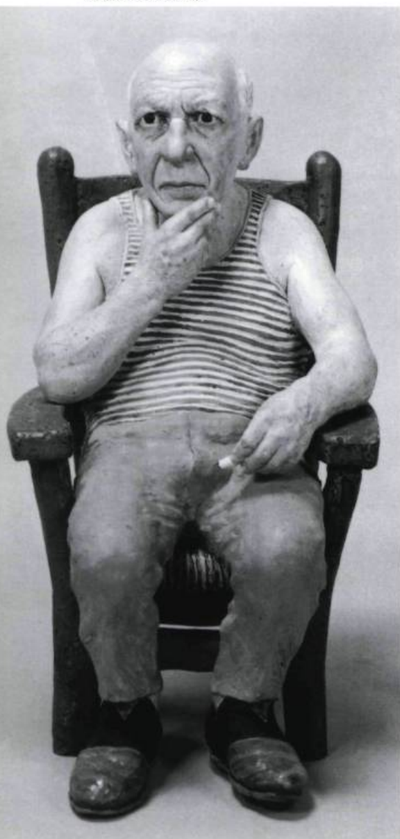
Joe Fafard, My Picasso , 1981. Clay, glazed and painted. 46.1 x 26.3 x 33.5 cm. Collection of the artist.