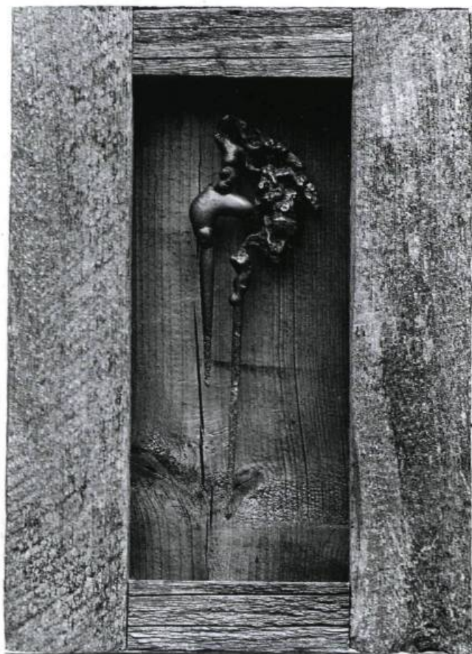
Pierre Racine, Passage , 1993. Bronze, wood. 33.02 x 22.86 x 7.62 cm.

Although Racine broke the standard stereotypes associated with paper art — the