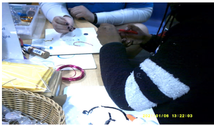
Figure 4. Photo of students working on their wire designs. Taken to reflect something creative. (Photo taken by student co-researcher)

There were commonalities across images that represented design principles three, “build from students’ interests and take a whole child approach to their development,” and four, “engage students’ and families’ knowledge in disciplinary learning.” This overlap between students’ interests and familiarities is not surprising. Many of the pictures portrayed materials