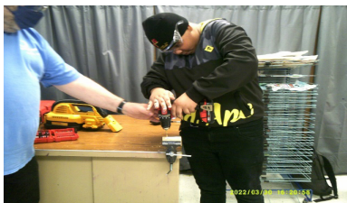
Figure 5. Photo of staff member stabilizing drill for student. Taken to represent team members interacting positively with others.

about a picture that he took of his brother using a cardboard cutter. Other pictures showed students bending wires, using glue guns, and drawing their designs on whiteboards (Figure 3).