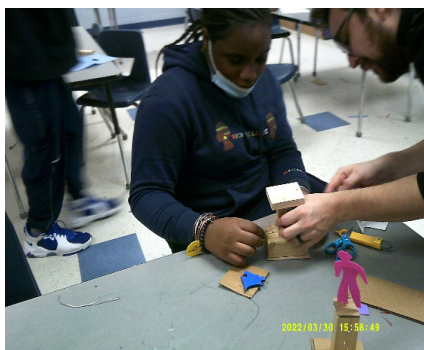
Figure 1. Photo of student and staff member working on crank puppet activity. Taken to show people having fun together.

The assessment was carried out in collaboration with fifteen middle school-aged program participants from two cohorts that were hosted at two different program sites. The evaluation process unfolded in five phases: 1) recruitment of co-researchers, including explanation of guidelines; 2) teaching co-researchers how to use the camera, including testing out the camera; 3) co-researchers observing, and taking pictures of, students and staff engaged in the makerspace; 4) informal photo interviewing; and 5) sharing with program staff via informal conversations and a formal meeting discussion.