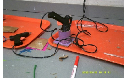
Figure 3. Photo of glue guns. Taken to illustrate students’ interests and familiarities.

The second design principle, “create a culture of affirmation and belonging,” was represented by photos that captured something in the activity that made the co-researcher feel happy. The images reflected mostly people who were meaningful to the photographer, engaging in positive ways, and/or expressing joy. For example, several pictures included siblings. One co-researcher pointed out proudly that his picture is of his little brother working (see Figure 2). Another co-researcher took a picture of himself with one of the community partner coordinators. He explained that he was sad that this person was leaving his position with the organization but happy for their friendship. A different co-researcher took a picture of his peer using a glue gun and said, “It makes me feel happy because she’s happy.”