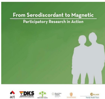
Figure 1. Magnetic Couples study

A modified narrative approach was used to describe four CBPR studies that I completed between 2014 and 2019 (Moen, 2006). I focused on cataloguing the strengths and limitations of community engagement as I reviewed my past projects and synthesized the findings against CBPR framework criteria to provide reflection for CBPR researchers as a society with evolving culture and practices. This section details each of the four studies. Community engagement strengths and limitations are synthesized in the following section.