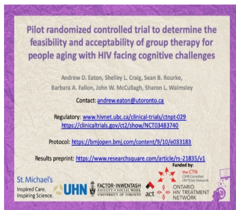
Figure 4. HAND Randomized, controlled trial (RCT)

These projects are part of my overall program of research to develop community-based interventions to address the complexities of living and aging with HIV. As illustrated in Figure 5, I attempt to mitigate such complexities (hospital discharge, cognitive health, and intimate relationships) through the interventions described above. To advance my research program, I assess these studies' results, consider how to adapt, scale, and implement these interventions, and evaluate community engagement. This paper represents a bird's eye view of that community engagement evaluation, where I consider my research program's strengths and limitations, and how my lessons learned can influence the culture of CBPR researchers and investigators considering the use of community engagement techniques in their investigations.