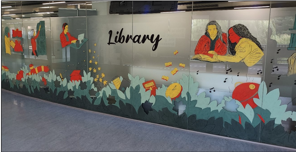
Figure 2 Library mural.